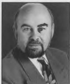
RUAIRI QUINN, T.D. MINISTER FOR FINANCE DUBLIN, IRELAND