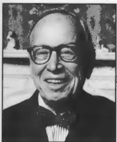
ARTHUR M. SCHLESINGER, JR. SPECIAL ASSISTANT TO THE PRESIDENT 1961-1964