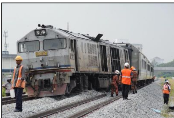
Figure 5: The KL-bound KTM trailed that derailed near Bukit Mertajam