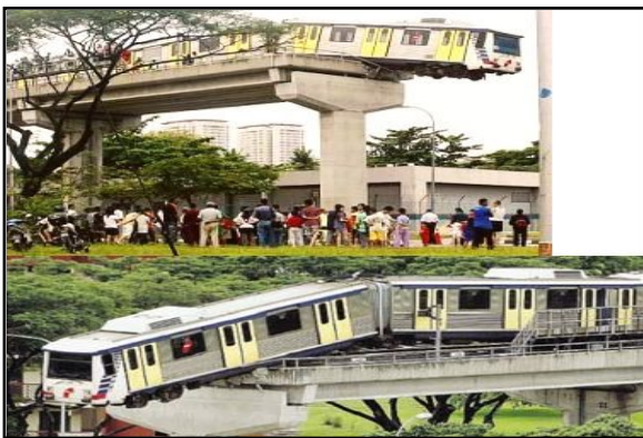
Figure 4: LRT coach hanging at end of track

KTMB train derailment at Bukit Mertajam happened at 2.45pm carrying more than 150 passengers (See Figure 5) in 2013. [6] The incident has caused the train engine to catch fire. However, in the incident, none were injured and the train service was not disrupted.