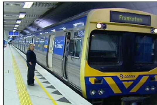
Figure 2: Yellow line – Safety Guide