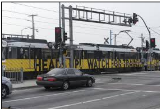
Figure 1: A car waiting at train crossing junction

A systematic method but yet simple to guide passengers at platforms are lines and signage. These lines are important to follow as they will act as a guide to passengers on the danger zones while at platforms. Figure 2 show a yellow line as a guide so that passengers will stand behind them while waiting for a train to arrive.