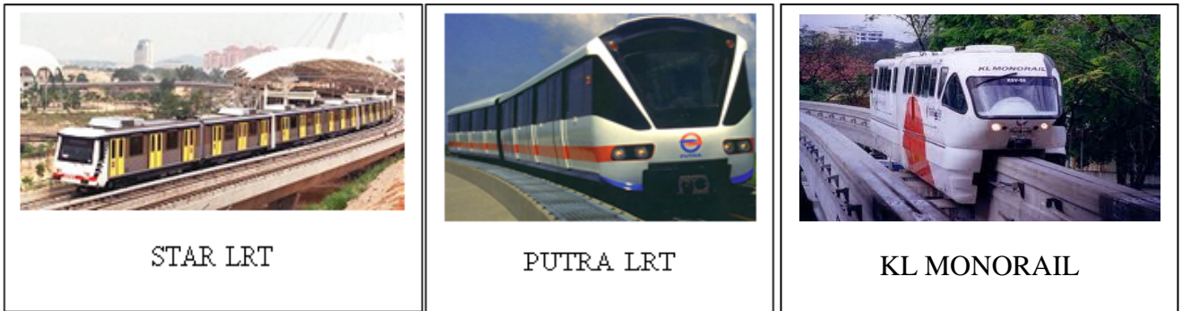
Figure 2 : Types Of Railway System On Malaysian (2014)

with existing traffic flow, more cost effective and time saving in the construction of the foundation/rail compared with a conventional runway [3].