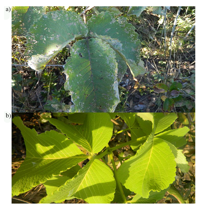
Figure 1. Leaves of Caryocar brasiliense in the dry (a) and in the rainy (b) seasons.

Experiments were conducted in Emas National Park (ENP) located in the state of Goiás, Brazil (17°49'-18°28'S; 52°39'-53°10'W) during the dry (July 2012) and rainy (September 2012) seasons with 20 Caryocar brasiliense plants per season. The plants had mature leaves and considerable herbivory during the dry season (Figure 1a), while EFNs were active and young leaves did not have signs of herbivory during the rainy season (Figure 1b).