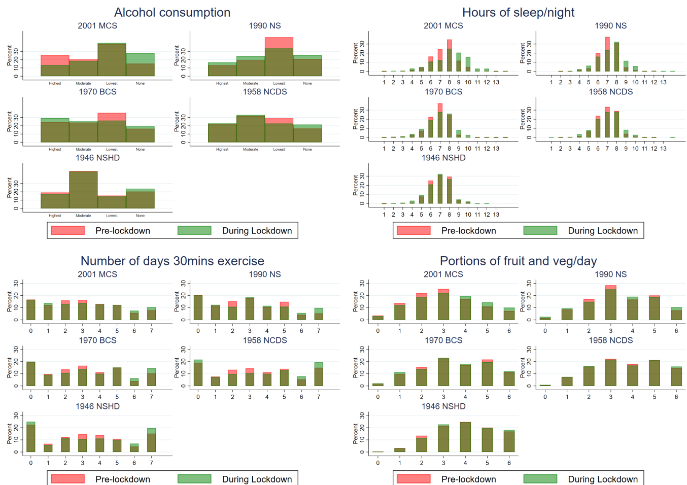
Figure 1 Before and during COVID-19 lockdown distributions of health-related behaviours, by cohort. Note: dark green shows overlap, estimates are weighted to account for survey non-response; alcohol consumption was derived as >36, 16–36, 1–15, no drinks per month.

before lockdown (figure 2, online supplemental table 1). Ethnic minorities had lower exercise levels during but not before lockdown—pooled per cent risk difference during (ethnic minority vs white): 9.0 (1.8, 16.3; I^2=0\% ; figure 2). Ethnic minorities also had higher risk of lower fruit and vegetable intake, with stronger associations during lockdown (figure 2). In contrast, ethnic minorities had lower alcohol consumption, with stronger effect sizes before lockdown than during (figure 2).