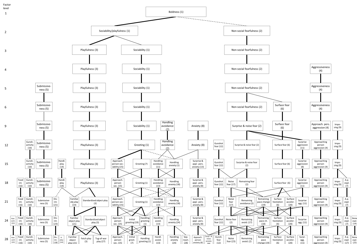
Fig. 2. A graphic presentation of the factor hierarchy from the top-down factor analysis procedure. Thin lines represent r_s > 0.6 and thick lines r_s > 0.8 ; dotted lines indicate negative correlations. The width of each box corresponds to the amount of variance accounted for by that factor.