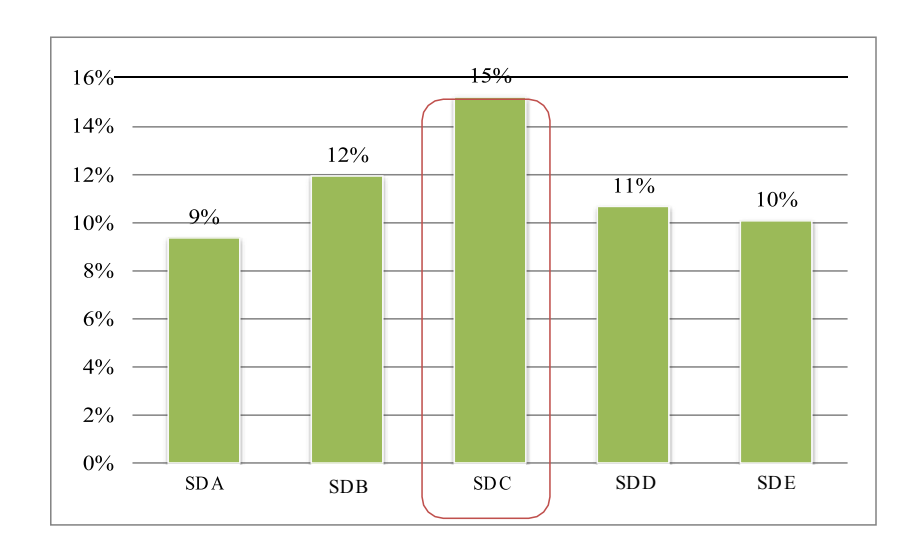
Figure 2 Total Lone Parents by School District (SD)

Household income is often used to create a general picture of income across a given geographical area and as a way of indicating the degree to which a family is financially stable (Statistics Canada, 2021). Figure 1 shows a sharp contrast of lower household income in the SDC zone in comparison to other zones in the city. Data related to parents living alone, as represented in Figure 2, is one indicator in attempting to establish a description of the family and home circumstances for the population in this zone of the city (Statistics Canada, 2021). This indicator also shows a higher percentage of lone-parents of the targeted zone compared to other zones. Significant for our study, the location of the schools in the SDC zone include a larger percentage of recent immigrants than other zones (Figure 3). Recent immigrants can face some of the highest poverty rates of any demographic group in the city (Statistics Canada, 2021).