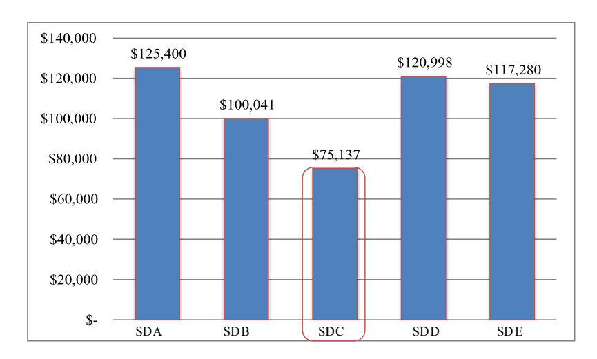
Figure 1 Average Household Income by School District (SD)