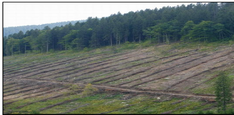
6. ábra Túllegeltetés miatt degradált talaj, Retezát-hegység (Dréksán völgy) Figure 6. Degraded land by overgrazing in Retezat Mountains (Drăgșanu Valley)

Within the ecological restoration, five tons (1600 seedlings) of creeping mountain pine and juniper seedlings were transported in Retezat National Park by Retezat National Park Administration, for the renaturation of a degraded area. The objective of such ecological restoration is to restore the mountain pine natural habitat in Drăgșanu Ridge area, part of Retezat Mountains, belonging to Retezat National Park, located between 1600 m and 1950 m altitude, on the northern slope of Retezat. In this area, the priority habitat has been destroyed, and the habitat area reduction occurred in the past due to deforestation activities in favor of extending the grasslands, using mountain pine and juniper as firewood by shepherds and tourists, and the intense adjacent grazing (KISS és ALEXA 2014a, 2014b).