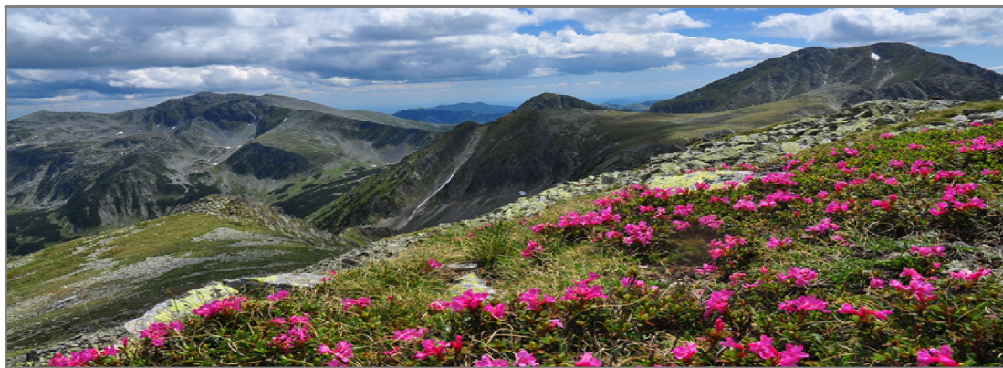
2. ábra Dréksán-nyereg a Retezát-hegységben Figure 2. The Retezat Mountains view on the Drăgșanu Ridge (Dréksán-nyereg)

Following a study on grasslands in Retezat Mountains (Retezát-hegység), the Retezat National Park Administration concluded that their area has decreased drastically due to overgrazing (REPORT 2012, 2013). The alpine habitats in Retezat National Park are abused by overgrazing, an example in this respect being Drăgșanu Ridge (Dréksán-nyereg), where the biodiversity is very low, being correlated with the abandonment of former grazing areas, which requires careful management measures.