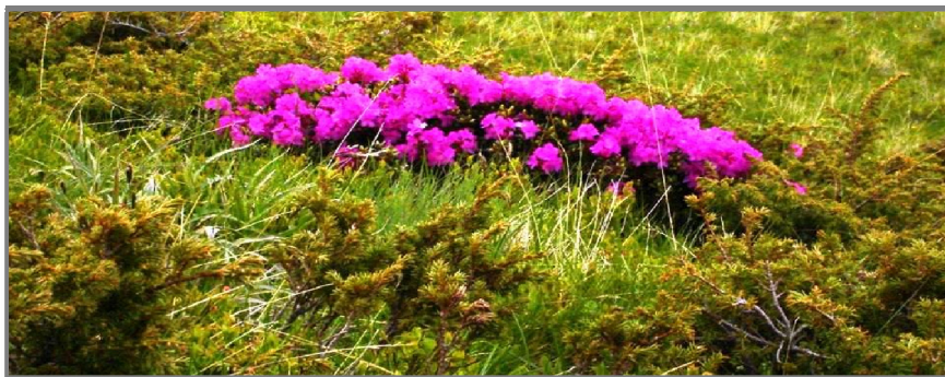
5. ábra Boróka ( Juniperus communis ) és rododendron ( Rhododendron ) társulások a Retezat-hegységben Figure 5. The juniper ( Juniperus sibirica ) scrubs with rhododendron ( Rhododendron kotschyi ) associations in the Retezat Mountains

Figure 4. The mountain pines ( Pinus mugo ) scrubs with rhododendron ( Rhododendron kotschyi ) associations in the Retezat Mountains