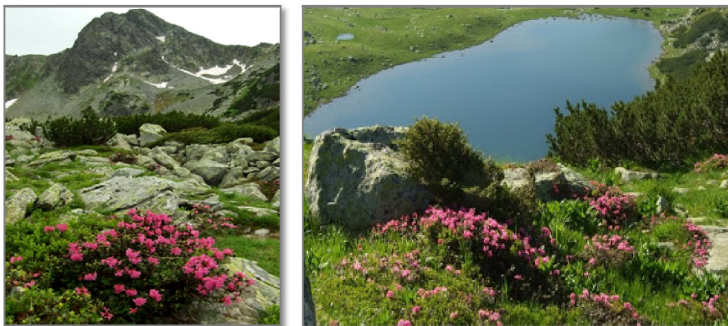
3. ábra A kúszó törpefenyő ( Pinus mugo ), a boróka ( Juniperus nana ) és a rododendron ( Rhododendron kotschyi ) közös élőhelye a Retezát-hegységben

The mountain pines ( Pinus mugo ) are dominant in the Retezat Mountains, spread over the entire subalpine floor, from the upper limit of the spruce forest ( Picea abies ), found at about 1500–1600 meters, up to an altitude of 2300 meters (CANDREA BOZGA 2009, RADU 2004, HODOR 2008). The large hedges covering the subalpine slopes, the mountain pine habitat, are mostly composed of creeping mountain pine ( Pinus mugo ), which grows either alone or associated with other arborescent woody plant species (especially spruce – Picea abies ) or juniper shrubs ( Juniperus ). Species of the genus rhododendron are widely distributed and are considered alpine native plants. Rhododendron kotschyi ( R. myrtifolium ) is found in the Carpathian in forest floor, pine scrub to open moorland on acid and limestone. It can form large stands in the alpine heaths growing along with Juniperus communis . Of the numerous species of Rhododendron, this (i.e. Rhododendron kotschyi ) is the only growing in Retezat Mountains, in alpine and sub-alpine areas, gaps in the mountains or on hillsides.