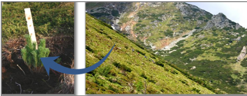
7. ábra Helyreállítási tevékenységek/A csemeték ültetése Figure 7. The restoration works/Planting of seedlings

All these led to the need to restore the former natural habitats, recovery consisting of strengthening by planting creeping mountain pine and juniper (seedlings). In these conditions, some ecological terraces have been made, on which creeping mountain pine was planted, for strengthening the soil. The planting of creeping mountain pine seedlings was organized by camps at altitude, with volunteers, with the support of Retezat National Park Administration and the assistance of Deva Forestry Directorate. To be noted that this is only one of the actions conducted within the conservative management activities aiming the alpine habitats of Retezat Național Park. Restoration works would target around 130 ha of valuable alpine habitats, mountain pine ( Pinus mugo ) habitats and alpine wetlands, and soil erosion would be prevented on several locations.