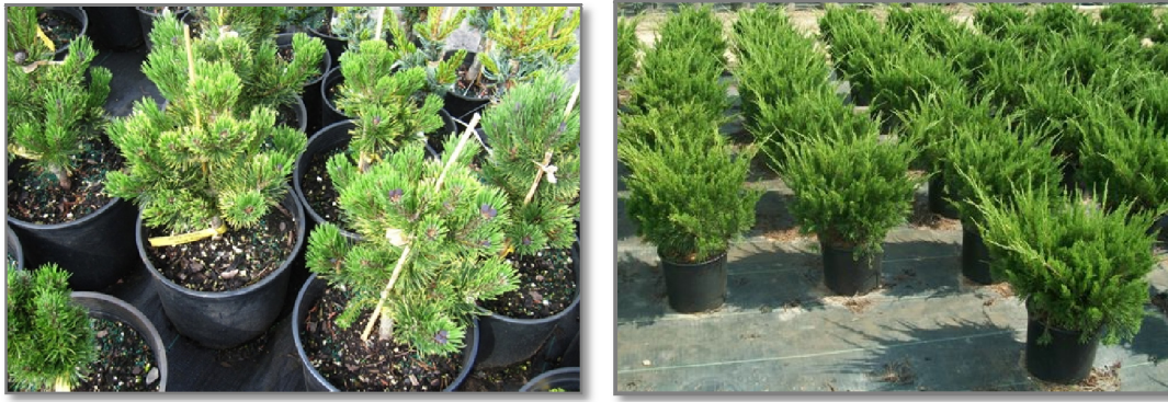
8. ábra Törpefenyő ( Pinus mugo ) és boróka ( Juniperus nana ) csemeték Figure 8. The mountain pine ( Pinus mugo ) and juniperus ( Juniperus communis ) seedlings

Therefore, the seedlings were grown in a nursery of the Forest Research and Management Institute, in Sinaia. The mountain pine seedlings of Pinus mugo were transported by truck from Sinaia, from the nursery of the Forest Research and Management Institute (ICAS), taken over by a helicopter, and brought in the affected area to be planted on Drăgșanu Ridge, in Retezat National Park.