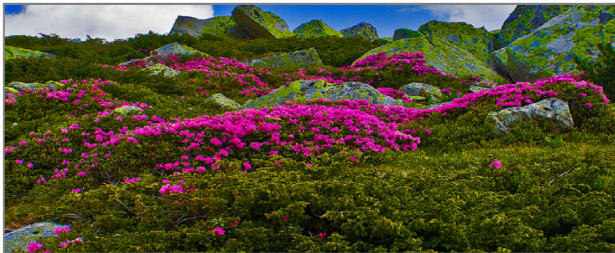
4. ábra Bozótos kúszó törpefenyő ( Pinus mugo ) és rododendron ( Rhododendron ) társulások a Retezat-hegységben

mountain pines compact thickets are crumbling, making way increasingly for undergrowth's of 30–50 cm height, such as rhododendron ( Rhododendron ). As this is a natural habitat to the upper limit of their forests, they are not required special management measures. In fact, that this type of habitat is very rare, it is recommended to protect themselves.