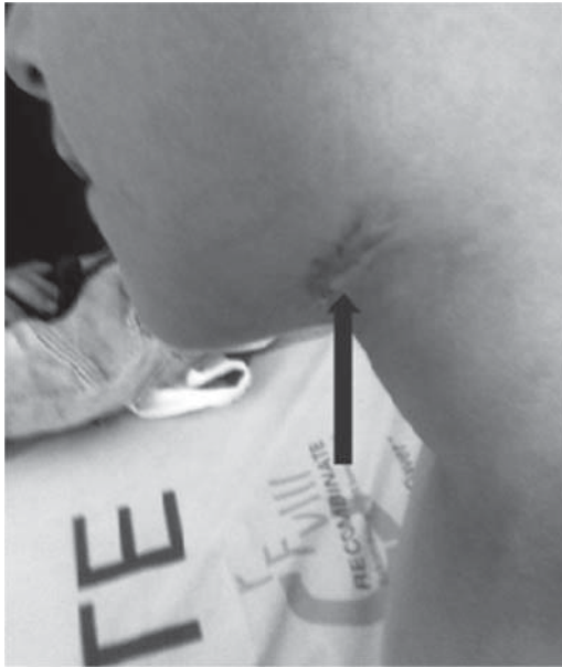
Figure 2. Sequelae of tuberculous lymphadenitis in patient 3