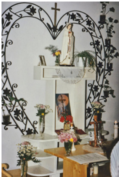
The "altar" in a privately owned Charbel prayer house. Csíkszentdomokos/Sândominic, 1994.