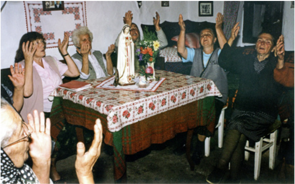
Thursday atonement prayer hour held in a private house, with the prayer gestures widely used in the charismatic movement. Korond/Corund, 2002.