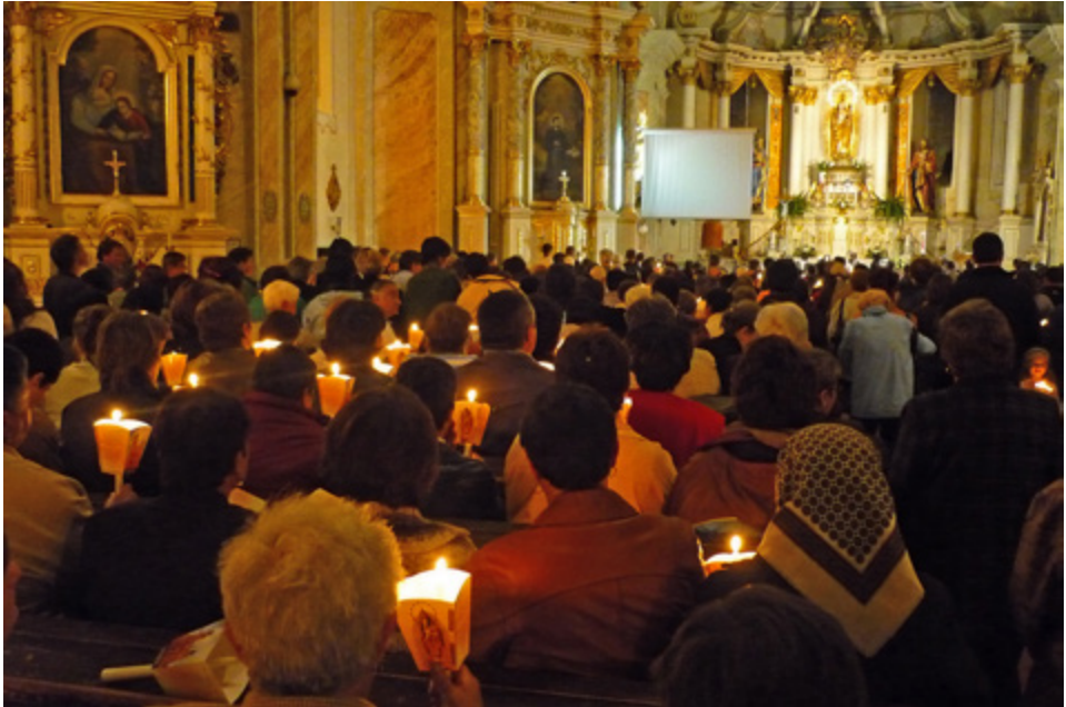
“Greeting Mary” on the first Saturday in the Csíksomlyó/Şumuleu Ciuc votive church. Csíksomlyó/ Şumuleu Ciuc, 2010.

clusion on 17 June 2005 when Mary made a declaration as the Queen of Light. On the occasion of her second and third appearances Mary initiated the creation of prayer groups, and the establishment of a “prayer centre”. To meet the requests in practice an atonement community was formed of two different denominations (Roman Catholic, Orthodox), and ethnic groups (Romanian, Hungarian), and night-time atonements on the 17 th of each month were introduced from December 1999. In my opinion the ideas for the practical implementation were influenced not only by the local parish priest and his faithful 69 but also by pilgrims from the Székelyföld region who were in close contact with the seer from the time of the second apparition. A number of them were committed practitioners and disseminators of atonement and they also had experience in launching the devotion practice. In response to a request received in a later message, the devotions on May 17 th were proclaimed the day of youth atonement.