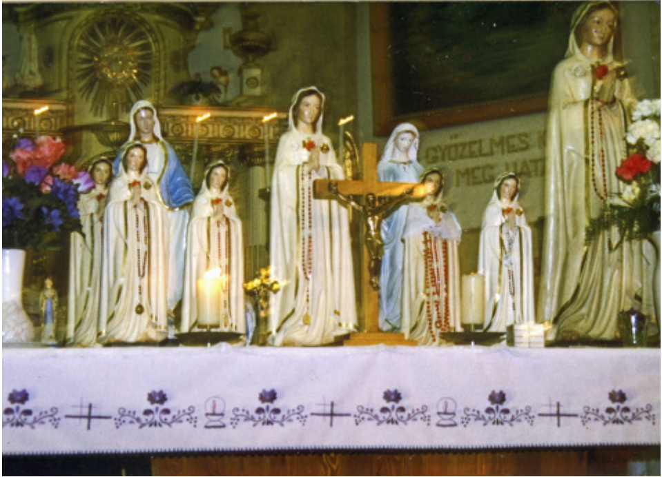
Atonement held on the 12 th of each month in the Saint Michael Archangel parish church in Érd-Óváros, the altar with statues of Mary carried by the pilgrims. Érd, 1995.

86 times since 21 March 1999 65 , Szilágynagyfalu 51 times since 13 August 2004 66 , Medjugorje 14 times since 20 October 2007 67 , Lourdes three times between 2005-2011 and Fatima on two occasions, in 2005 and 2011.