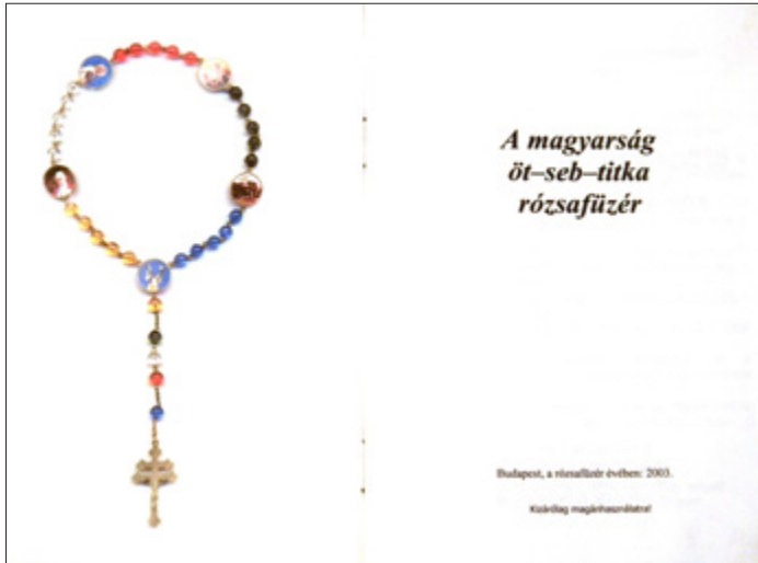
Cover of the prayer booklet presenting the Mystery of the Five Wounds of the Hungarian People rosary.

The Latin prayers were introduced with the help of a teacher of Latin and Romanian who sometimes takes part in the devotions; it was considered important to introduce them because they regard the Latin language as the purest, in the sense that it is the most free from sacrilegious words. The special feature of this form of prayer is that they not only pray in several languages (both alternately and simultaneously 84 ), but also that they learn a given prayer in an unknown language. The difficulty they undertake adds to the value of the sacrifice.