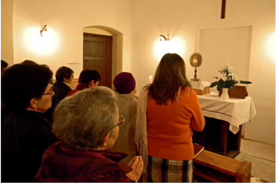
Atonement held together with the Act of Adoration on the 13 th of each month in the side chapel of the Zetelaka/Zetea parish church. Zetelaka/Zetea, 2010.