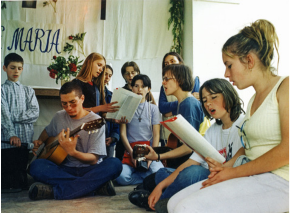
Prayer hour for a children's group on the May youth atonement day. Szőkefalva/Seuca, 2002.