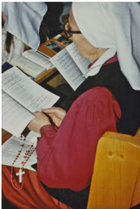
Devotions in a Charbel prayer house, showing the Atonement Prayer Hour prayer booklet and the Flame of Love rosary in use. All the participants are wearing the prescribed white headscarf. Csíkszentdomokos/Sândominic, 1994.

According to his idea, with the Trianon peace treaty (1920) resulting in the loss of five parts of the country, Hungary received five wounds, that is, it was crucified, thereby reaching the highest degree of atonement sacrifice. Five Hungarian vocations 81 are expressed in the mysteries of the rosary, each fifth bead is followed by a medal bearing the portrait of a historical figure, a person of the church or a saint. 82