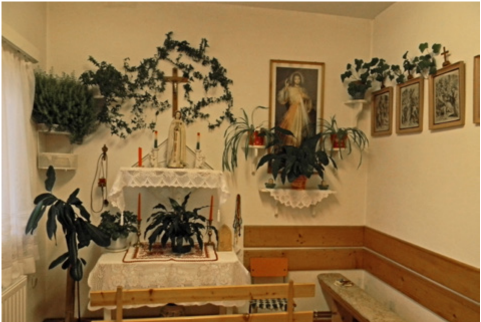
Privately owned atonement chapel. Szentegyháza/Vlăhița, 2010.