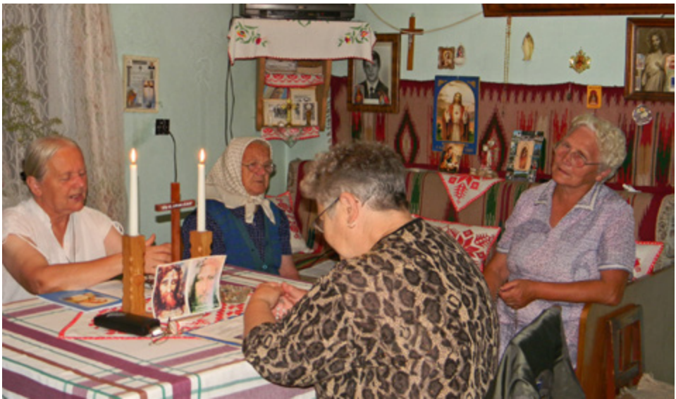
Atonement devotions performed regularly every week in a private house under the influence of the phenomena in Szilágynagyfalu/Nuşfalău. Csíkmenaság/Armăşeni, 2011.