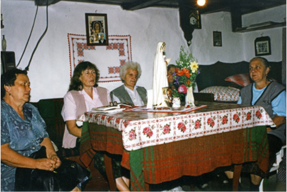
Thursday atonement prayer hour held in a private house, around a table decorated like an altar. Korond/Corund, 2002.