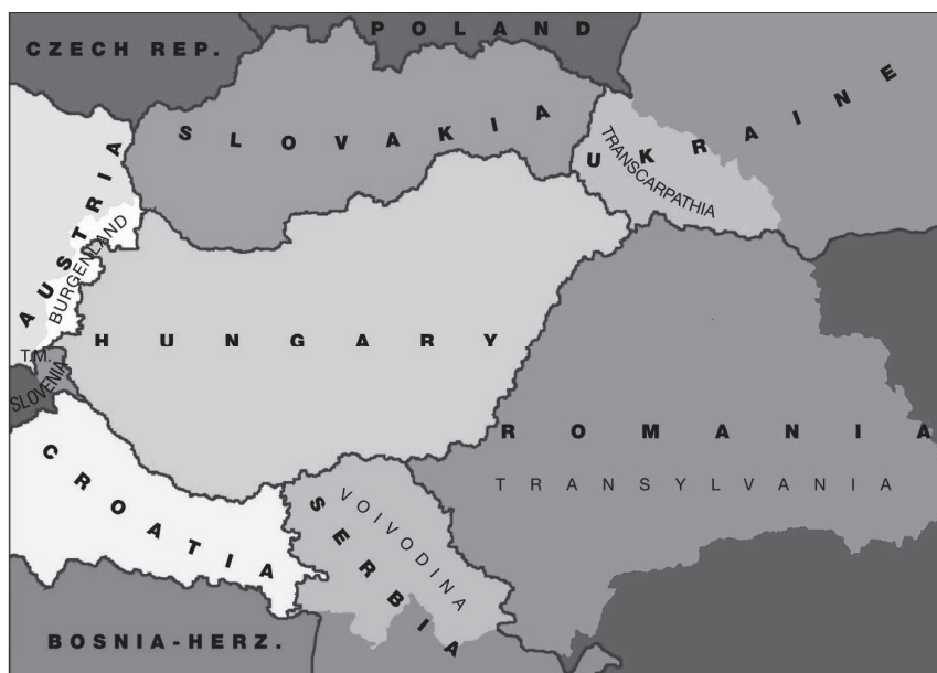
Figure 1. States, regions forming the Carpathian Basin

The rapid statistical decrease of the number of Hungarian minorities in the Carpathian Basin in the years between 1920 and 1930's was stemmed by territorial revisions between 1938 and 1941 (e.g. First and Second Vienna Awards). In this course, the majority of Hungarian-inhabited territories lost in 1920 (present-day South Slovakia, Transcarpathia, North Transylvania with Szeklerland, Bačka, present-day Croatian Baranya, Slovenian Transmura Region) were returned to Hungary. In the returned regions, especially in Transcarpathia, in Slovakia and in Transylvania, the number of people declaring themselves Hungarian was increased by the return of Hungarian public servants (clerks, policemen, soldiers etc.), by the settling of Hungarians from Bukovina, as well as by bilingual population and the majority of Jewish people becoming Hungarian native speakers again.