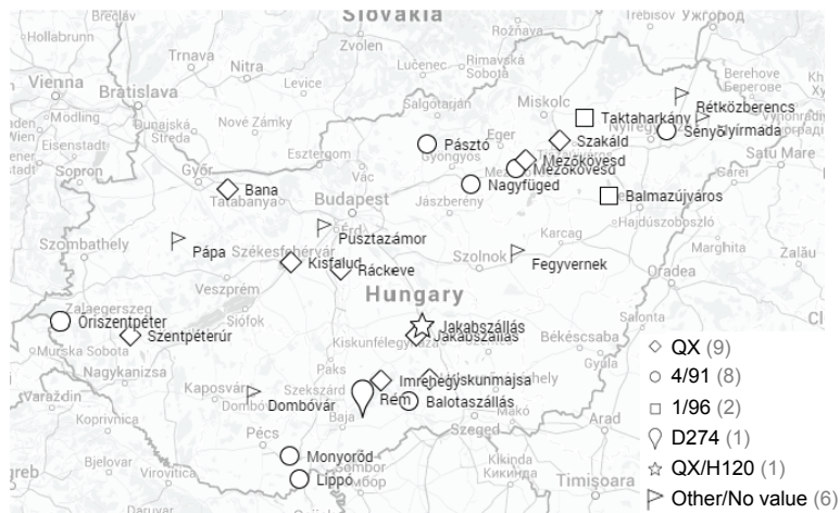
Fig. 2. Geographic distribution of the farms submitting the samples. The detected serotypes are identified with polygonal symbols

Reoviruses are frequently isolated from clinically normal chickens and the outcome of reovirus infection depends on several factors including age and immune status of the bird, route of exposure, virus pathotype, and interactions with other pathogens. Certain reovirus strains are even immunosuppressive and, thus, may enhance the severity of concomitant infections (Engström et al., 1988; Jones, 2013). While not sought for specifically, our results confirmed the ubiquitous nature of reoviruses in meat-type chickens (Jones, 2013), apparently in the lack of clinical disease.