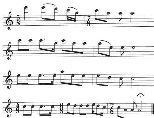
Example 7. Melodies with large range: four-section melody with A'-E-C-A cadences (23–9)

There are a limited number of Dakota melodies with a range wider than an octave. 21 As an example I show a four-sectioned melody with A'-E-C-A cadences ( Ex. 7 ).