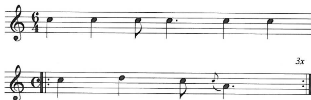
Example 1. Narrow-range melody

There are melodies moving on 3 or 4 tones: (E)-D-C-A. These melodies may differ from each other considerably and probably represent different old layers of the Dakota folk music. Simplest is a story song reciting on C then descending to A, and some lullabies moving up and down on the D-C-A triton sometimes reaching E as well. The majority of these basic songs built up of two short repeated sections with C or D cadences have a descending character ( Ex. 1 ).