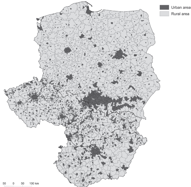
Fig. 3. Urban and rural LAU 2 in Visegrad countries by the population density 5

from an unfavourable location but they may not. Three types of such areas were studied most often by Polish geographers: areas of ecological danger, areas with demographic problems and agricultural problem areas. Research into the first subject was carried out especially during the 1970s and 1980s, when polluting emissions were much higher and less controlled than currently (Kassenberg and Rolewicz 1984; Rola-Kunach 1984; GUS 1992). According to these research papers, rural problem areas can also be identified as distinct from peripheral ones. Although areas with demographic problems (Jelonek 1986; Eberhardt 1989; Bański 2002; Bański and Mazur 2009) and agricultural problem areas (Kulikowski 1992, 2003; Bański 1999; Rosner 1999) usually co-exist with peripheries and stimulate each other, there are also some exceptions identified in this matter because the genesis of them can be something other than distant location, e.g. structural or historical. Also certain specific types of problem area sometimes used to be identified, for instance so called areas of conflict. They result from a shortage of space and competition between different functions. They are identified by the circumstances of the advantage of demand for certain assets of given space over its supply. They are also identified rather in suburban zones than in peripheral areas.