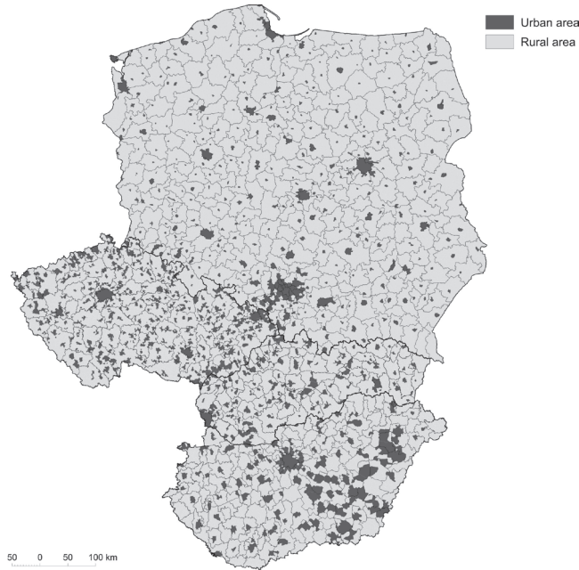
Fig. 1. Urban and rural LAU 2 in Visegrad countries by the number of inhabitants (see the criteria in the text above)

Another standard frequently used in the delimitation of rural areas is population density. This is rather used at LAU 1 or NUTS III level, as it is in the OECD methodology (OECD 2011) which is also often used in documents and planning strategies within the European Union, but might also be applied at the LAU 2 spatial level. As shown by Figure 2, differences in population density among the regions are significant but at the level of countries as whole differences are much lower.