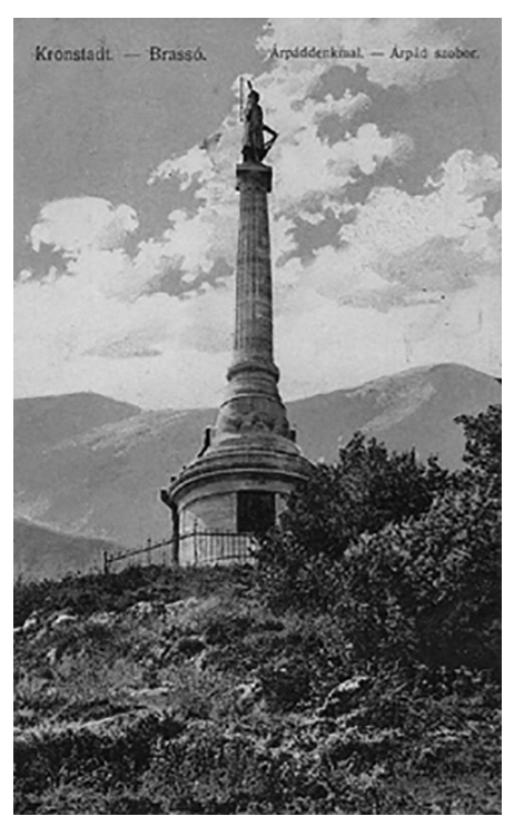
Fig. 4. Árpád Monument in Brassó by Gyula Jankovich. Contemporary postcard, 1896

had been initiated by Kálmán Thaly, a member of the gentrified middle classes, and the concept was a clear statement of intent against the separatism of non-Hungarian ethnic groups (Sinkó 1993: 134–136). Many of the border regions where the monuments were erected had significant populations of minorities who would have been ethnically closer to the 'foreigners' living in neighboring nation states. Combining the national, international and universal aspects, Zichy considered the arrival of the Magyars as an event of global significance, so a universal exhibition would provide the international framework for the commemorative festivities of the national jubilee. (Fig. 4.)