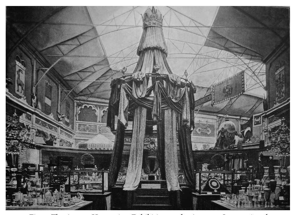
Fig. 3. The Austro-Hungarian Exhibition at the Antwerp International Exhibition in 1885