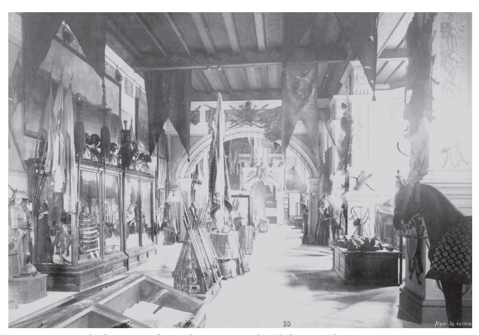
Fig. 7. Detail of Interior from the Historical Exhibition, the Rennaissance Wing, Exhibition of Military History

Alpár's architectural solution, interlinking the characteristic styles of different periods in art history, served as the framework for the (mainly ambiental) display: the reconstitution of historical interiors was an early Hungarian example of the museological concept of Alexandre Lenoir and Alexandre du Sommerard. Even though the Millennium Exhibition had been planned as a national industrial and agricultural exhibition, the retrospective aspect eventually dominated the entire display. This was true not only in the historical section, but also in the fine art exhibition at the Hall of Arts (Műcsarnok), which contained a retrospective show on Hungarian art since 1800. The historical exhibition's starting point referred to Saint Stephen's coronation as Hungary's first Christian king. The Act of Foundation, a crucial moment of the Millennium Year, framed the exhibition itself.