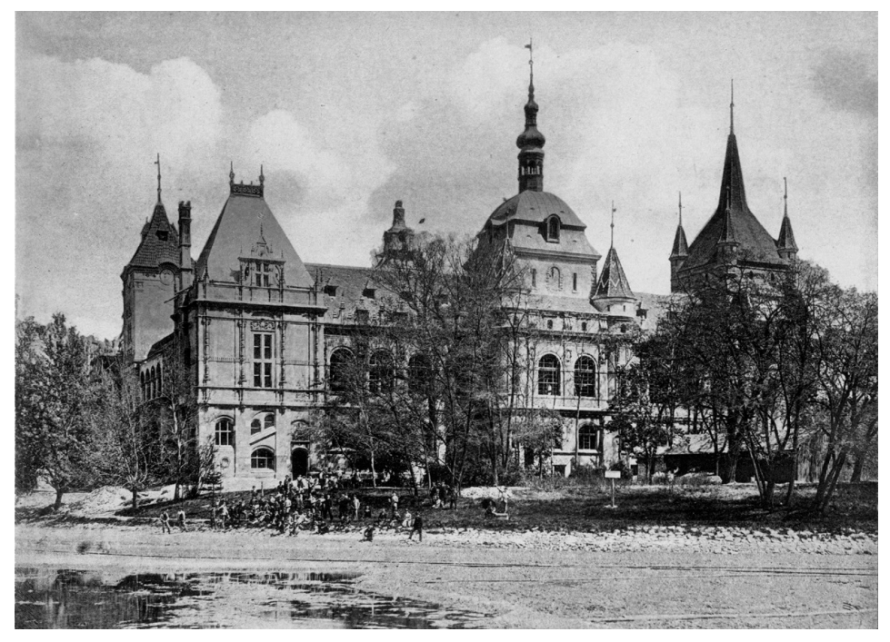
Fig. 6. The Rennaissance wing of the Main Retrospective Group of Ignác Alpár. 1896

Lucas von Hildebrandt. The original constructions were all national monuments by that time (Lővei 2013). As exemplars of bringing together architectural motifs from diverse periods, we can point to the Bern Historical Museum or the Bavarian National Museum (Sisa 2013: 603). The interiors of the Main Historical Group displayed reconstructions of significant sites in Hungarian history, recreating a lively atmosphere in the spirit of a Western and Habsburg-oriented historiography (Sinkó 1993: 141). ( Fig. 5)