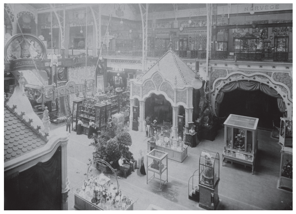
Fig. 9. Caption: Detail of the Hungarian Exhibition of Applied Art in the Universal Exhibition, Paris, 1900

the final decision to use this material was not taken until quite late on, in 1894, its deliberate use echoed the original will of the architect: Lechner's vision was to create a uniquely Hungarian Bekleidung on the historicizing core - reflecting broadly defined oriental origins, and the modern role of the vernacular heritage.