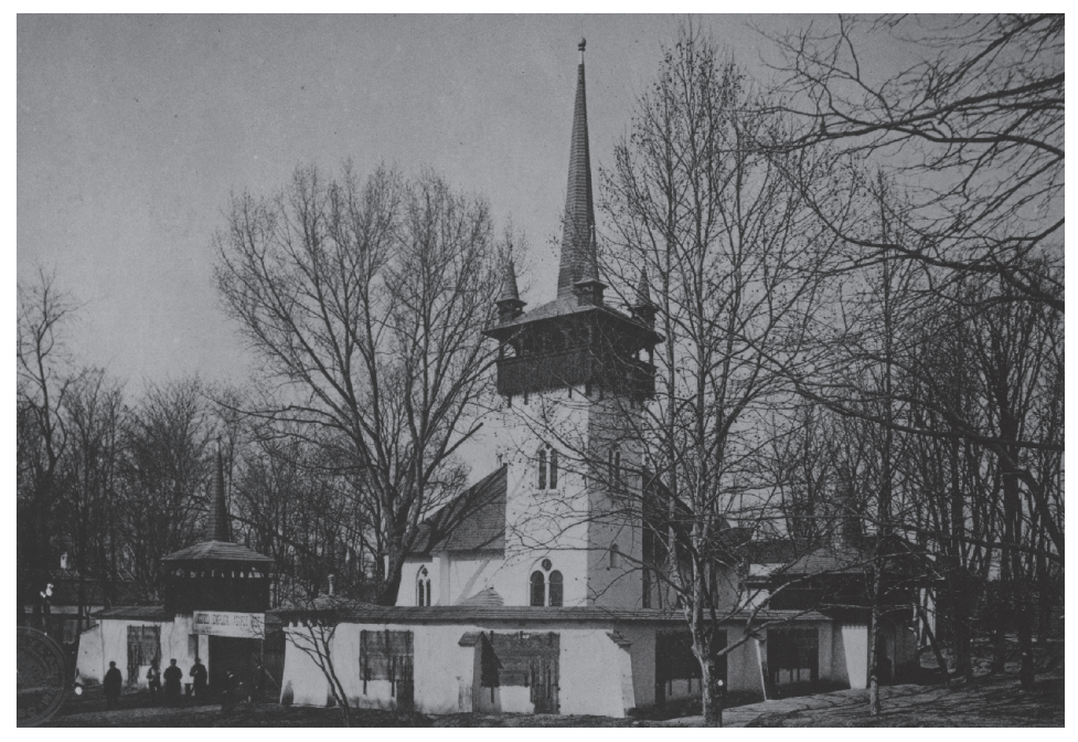
Fig. 8. Detail of the Ethnographic Village, House from the Hungarian Transylvanian willage of Torockó. 1896

historiography, that the nation and its people had 'Eastern', that is, oriental origins. The truth, for want of reliable written sources, remains uncertain, and is thus the subject of speculation and artistic creativity. For Ödön Lechner (1845-1914) and his pupils – and also for a large section of the Hungarian intelligentsia – this idea served as the starting point for a new architectural model. Hungarian vernacular culture, as the well-spring of authenticity and as the custodian of roots stretching back to the pre-literate times of the Hungarian Conquest, was represented on one of the newly inaugurated public buildings of the capital, the Museum and School of Applied Arts. The competition to design the Museum of Applied Arts had been launched in 1891, with construction work lasting from 1893 to 1896, while approval of Lechner's plans was granted simultaneously with an upsurge in debates on the Millennium Exhibition. The inauguration of the Museum of Applied Arts - one of the concluding moments of the Millennium Celebrations in October 1896 - heralded the dawn of a new paradigm in the quest for a modern Hungarian architecture. (Fig. 9)