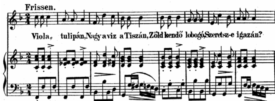
Fig. 3. Bartalus István's printed collection, vol. 2, 146

century. 2 Therefore its appear in the printed edition is not a novelty. However, the manuscript reveals that the tune was sung to Bartalus by a peasant girl from Dédes, a village of Northern territory (see Figure 2). The tune is the 80. one of the first volume of the manuscript, that is, it was transcribed at one of Bartalus' first field-works, thus it testifies the fast spread of popular tunes. Popular songs which were sung by peasants and appeared by Bartalus with data of field-work are considerable as sources for the research of connections of urban and peasant music, and they lighten the miscellaneous repertoire of peasants. The songs noted from the cited village, Dédes are examples of that phenomenon. Some tunes of the villages are noted from a 75 years old peasant woman who sang four old-style, descending tunes and a popular song (Bartalus n. d., Vol. 1. 74-77 and 83). But there are besides three descending melodies, three well-known popular dance tunes and three new style folk songs from the village in the manuscript with the mark 'after a peasant girl' (Bartalus n. d., Vol. 1. 78-82, 86-88 and 90). These data of partly different repertoire of generations are peculiarly interesting for historical ethnomusicology, for example from the point of view of the study of the new style Hungarian peasant song mentioned above, which was inspired by urban music of the second half of 19 th century.