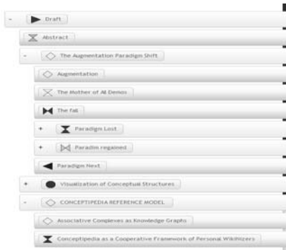
Fig. 2-2. Rearrange the pages in Outline View via Drag and Drop