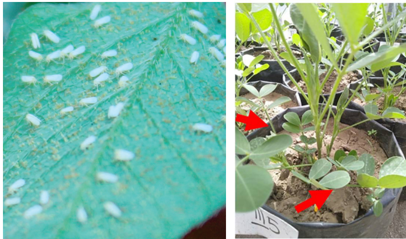
Figure 1. Leaf peanut position use for sample observation.

were used to identify a possible relation between whitefly population and leaf characteristics of different genotypes. Path analysis was used to identify direct and indirect effects between whitefly population and leaf characters of different genotypes.