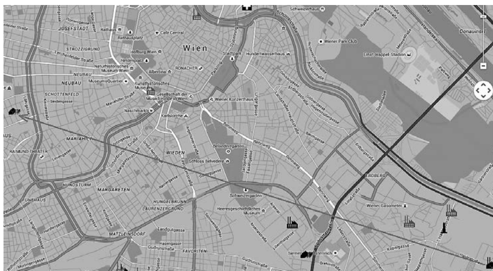
Map 2.: The Distance Between the Saurerwerke in Lobau and the Hackengasse Wohnlager