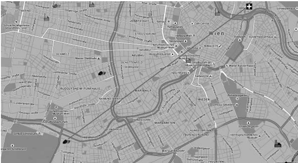
Map 3.: The Distance Between the Bischoffgasse-Wohnlager and the Spital in Malzgasse