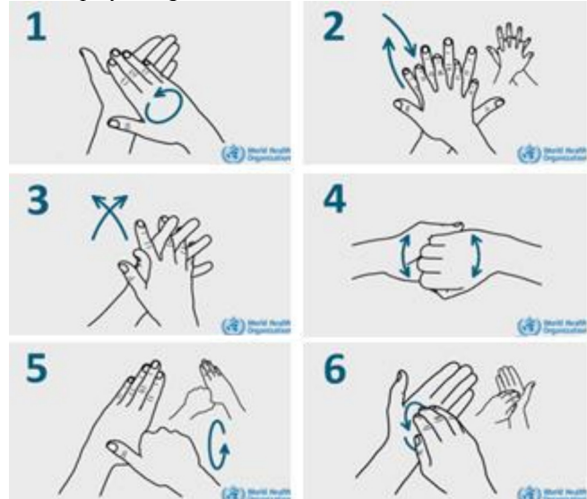
Figure 1 WHO's world renowned 6-step hand hygiene protocol—a global standard.

96.6%, while urinary tract infections dropped by 33%, pneumonia-linked ventilation infections by 61% and central-line associated bloodstream infections by 80%, respectively [30]. This data show the difficulty to implement correct hand hygiene practices in a busy environment, where human factors play a huge role.