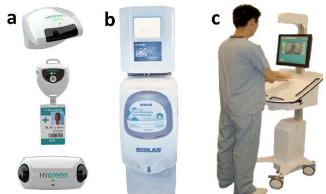
Figure 3 Examples of electronic hand hygiene systems: HyGreen, Proventix nGage and SureWash.

It is not the mere number of hand washing events per day ("frequency") that is only important but also when (and how) HCW wash their hands. The number of opportunities to perform hand hygiene (as determined by WHO's 5-moments