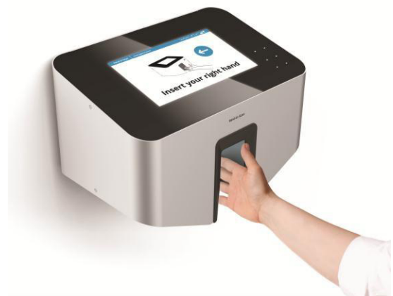
Figure 4 The Hand-in-Scan Medical Trainer hand hygiene monitoring and control system.

Hand-in-Scan (HandInScan Kft.) is a recent innovation of a Hungarian start-up company, employing digital imaging and image processing to instantaneously identify any missed regions on the hands. Hand-in-Scan objectively evaluates and records every hand disinfection event per person, and is able to generate statistics and proper reporting to the management (Fig. 4). Implementing the experiential learning theory, the user learns the correct hand washing technique while performing it in front of the device. Hand-in-Scan provides immediate feedback on hand washing performance, resulting in healthcare worker's hand hygiene compliance and technique improvement. The system eliminates the blame-factor, and helps to avoid the boss-subordinate conflict [35].