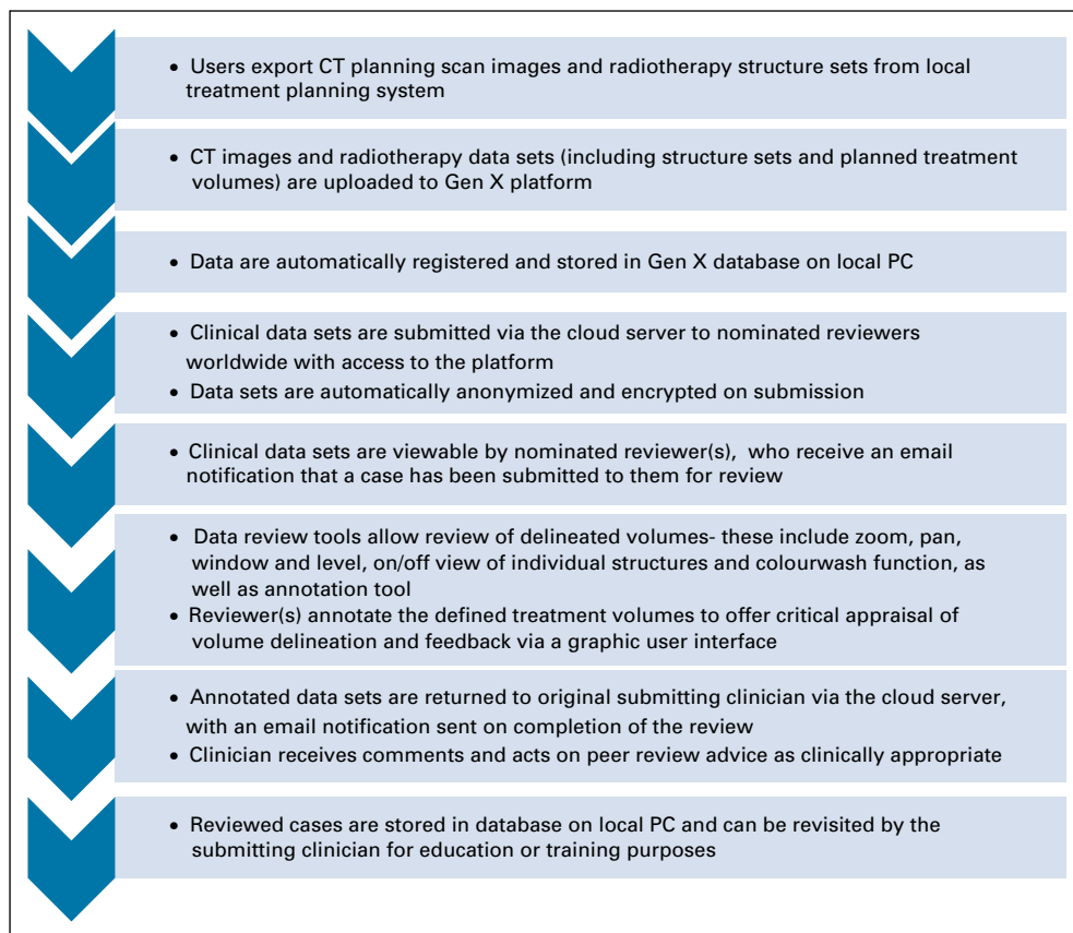
FIG 1. Gen X Cloud Platform Functionality. CT, computed tomography.

For the initial needs assessment, we reviewed the existing radiotherapy treatment facilities, including treatment machines,