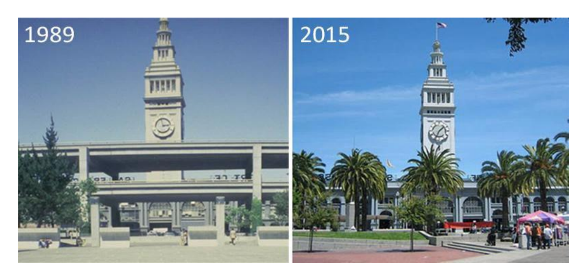
Figure 3. From Embarcadero Freeway to Boulevard led to a value increase of about $118,000 per unit

reinstated tram. In both cases the effect was strongly positive with the benefit being around $118,000 per home by the former Embarcadero freeway and around $116,000 by the former Central freeway. A less robust study into the impact of the replacement of Boston"s Central Artery freeway with an underground facility and the transformation of the surface to a linear parkway and boulevard also found strongly positive price impacts (Bartholomew & Ewing, 2011).