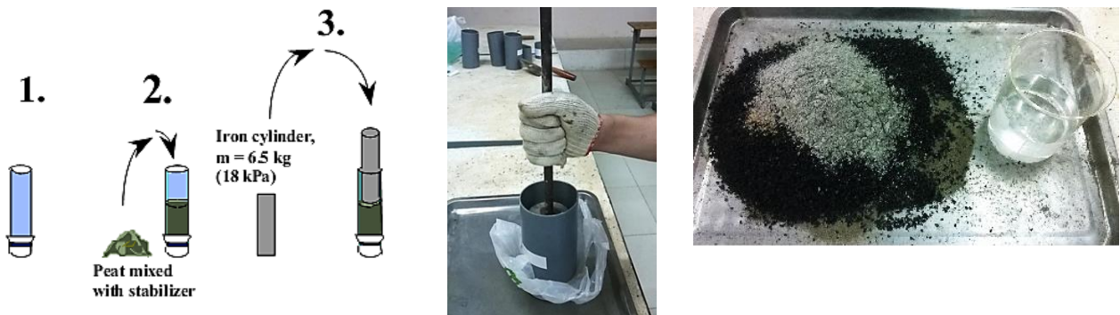
Figure 1. Material mixing. a) Procedure of soil compaction ; b) Mixture prepare

Undisturbed soil samples were crashed and tested to determine physical properties. Then a mixture including dried soil grains, cement at very small percentage by weight, rubber grains and medium sand were mixed (Figure 1). Compaction in cylinder 90mm in diameter was done layer by layer of about 3-4cm thick.