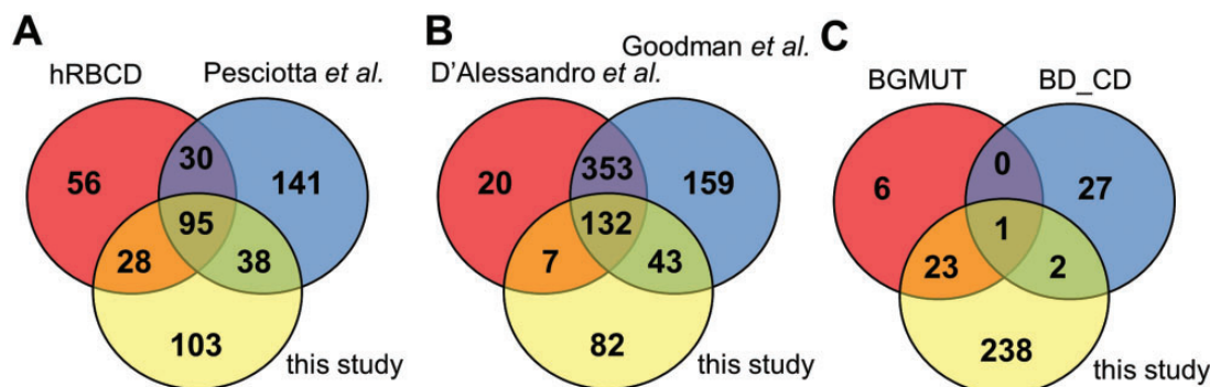
Figure 2. Comparison of the coverage of RBC transmembrane and membrane-associated proteins in different datasets. (A) The presence of membrane proteins in MS datasets, (B) in comprehensive reviews and (C) in highly validated data sources are compared with membrane proteins identified in our MS study. hRBCD, human RBC Database; Pesciotta et al. , D'Alessandro et al. , and Goodman et al. are references to (6, 10, 11); BGMUT and BD_CD mark the human blood group database and the CD marker table provided by BD, respectively.

identification systems (18). Moreover, our data are UniProtKB centred in a way that the basic properties of proteins (e.g. name, function, genetic variants, cross-references, etc.) are taken from this database, since it is a manually curated with high reliability.