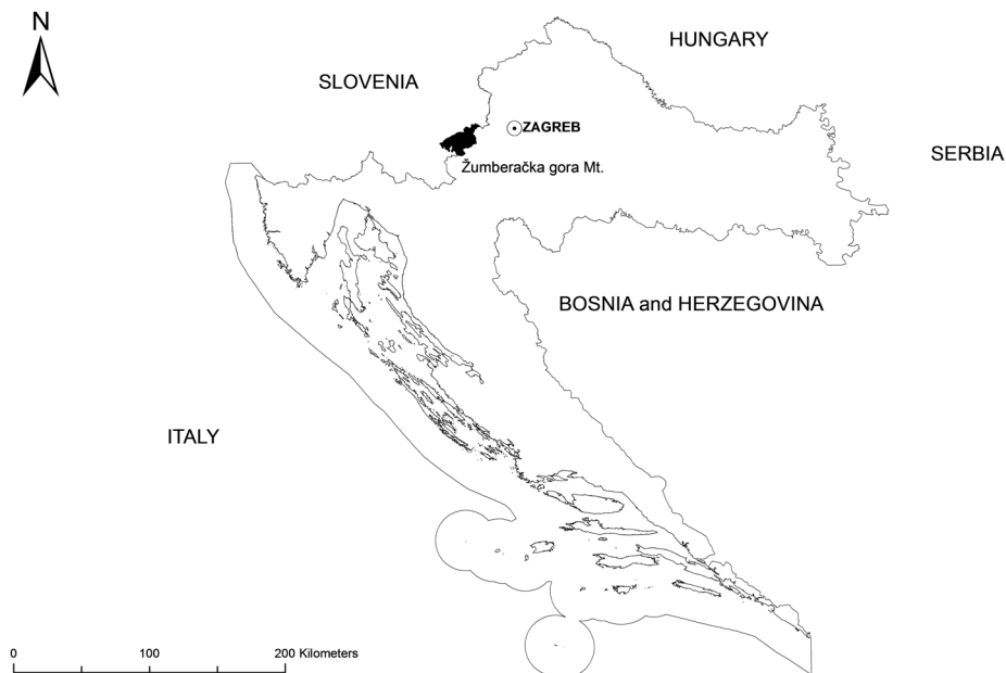
Fig. 1. The investigated area.

2. Žumberačka gora Mts, Pogana jama pit at Kuta, pit and surrounding limestone rocks, 45.79161° N, 15.43128° E, 875 m, 23.07.2014.