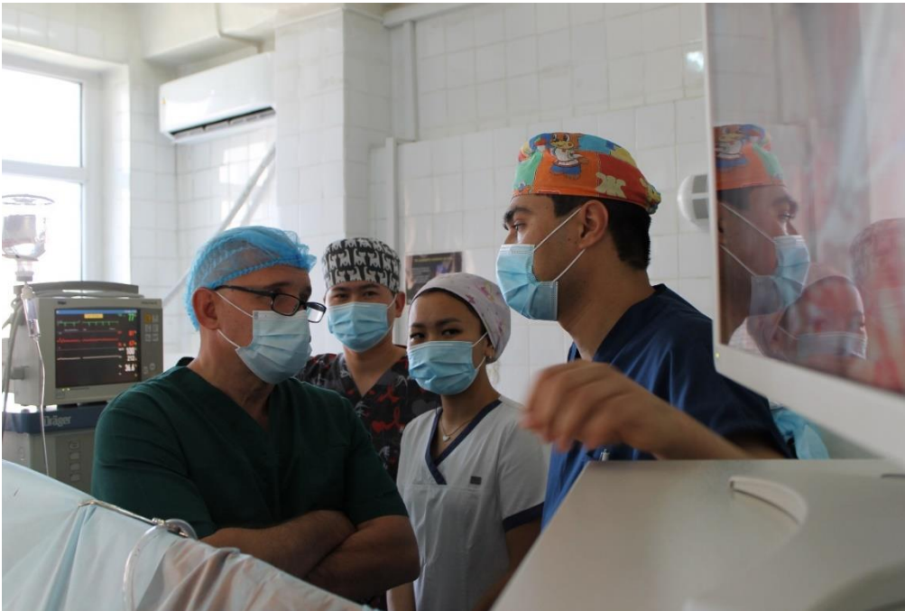
c) Figure 2. Joint master-class cardiac surgery operations by Ukrainian, Kazakhstan and Kyrgyzstan surgeons

Important, actual and emergent directions of the development of cardiac surgery fields as mini-invasive cardiac surgery and surgery of chronic heart failure