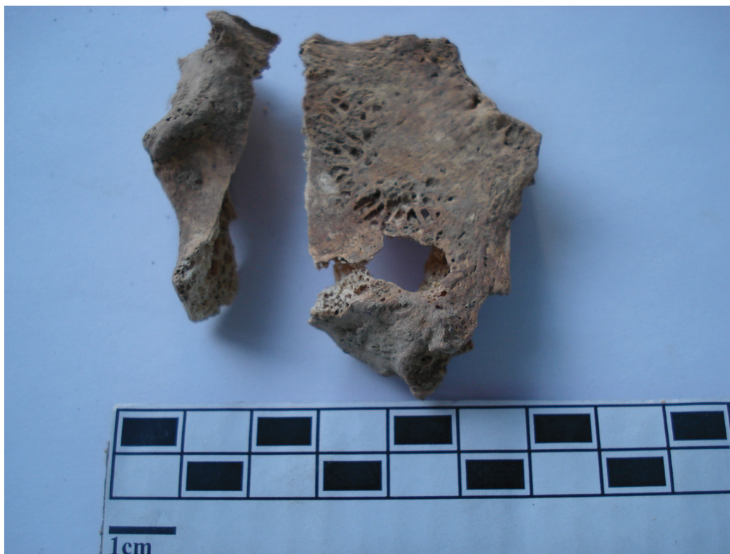
Fig.2. Manubrium with the perforation of the anterior and posterior cortex.

The bodies of lumbar vertebrae are characterized by a considerable compression with the osseous block. In this case we suspected tuberculosis. MTB is caused by a group of closely related bacterial species called the M. tuberculosis complex. Other bacterial species are widespread in the environment but members of the MTB complex are obligate pathogens. The principal cause of human tuberculosis is M. tuberculosis . In this case infection occurs via droplet infection. Humans can also become infected by M. bovis . The main sources of infection are milk, dairy products and meat from an infected animal. But it is estimated that M. bovis is responsible only for about 6% of human tuberculosis cases (Hardie, Watson 1992). MTB relates to people of all ages, although in most cases the archaeological material concerns, for obvious reasons, the skeletons of juveniles (Ortner 2003, 2008; Stone et al. 2009). MTB is a social disease and the most common predisposing factors are poverty and associated malnutrition, overcrowding, poor hygiene and the sharing of living accommodation with animals (San-