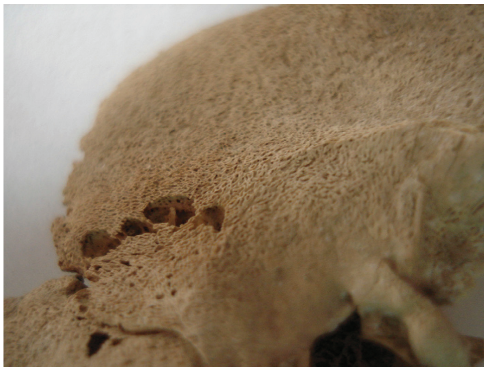
Fig.5. Temporal bone with suspected hematogenous osteomyelitis (TQ 29C90).