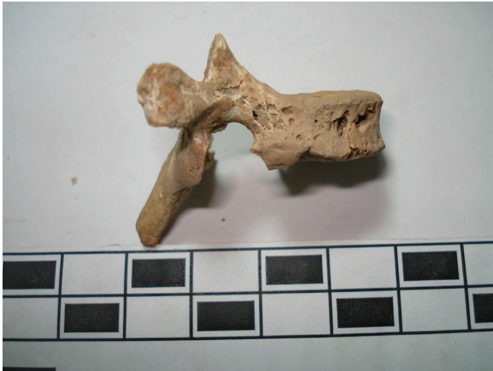
Fig.3. The lytic focus with minimal remodeling – lateral view of Th4 (MK 15L58).