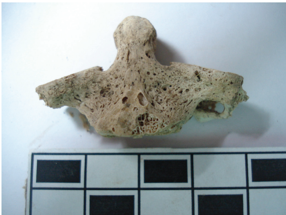
Fig.4. Suspected ostemyelitis on axis (MK 12G193.1).