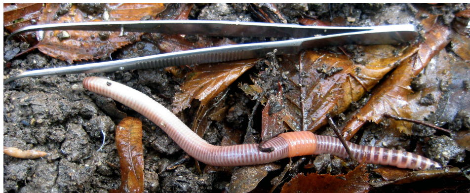
Fig. 3. Dendrobaena virgata sp. n. Photo of a living specimen.