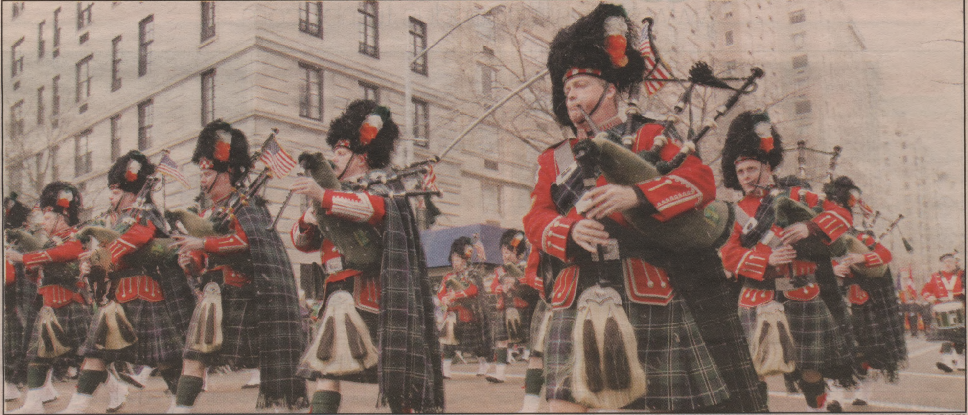
MEMBERS OF THE NEW YORK CITY FIRE DEPARTMENT'S EMERALD SOCIETY PIPES AND DRUMS MAKE THEIR WAY UP NEW YORK'S FIFTH AVENUE AS THEY TAKE PART IN THE ST. PATRICK'S DAY PARADE.