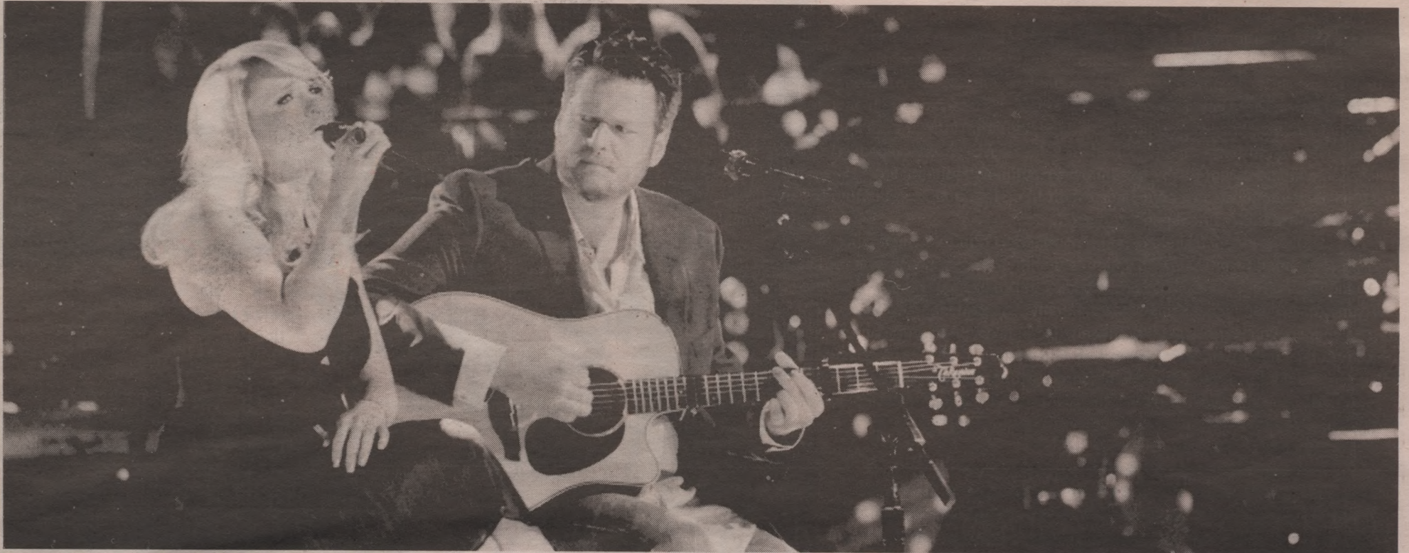
MIRANDA LAMBERT AND BLAKE SHELTON PERFORM IN CONCERT TOGETHER.