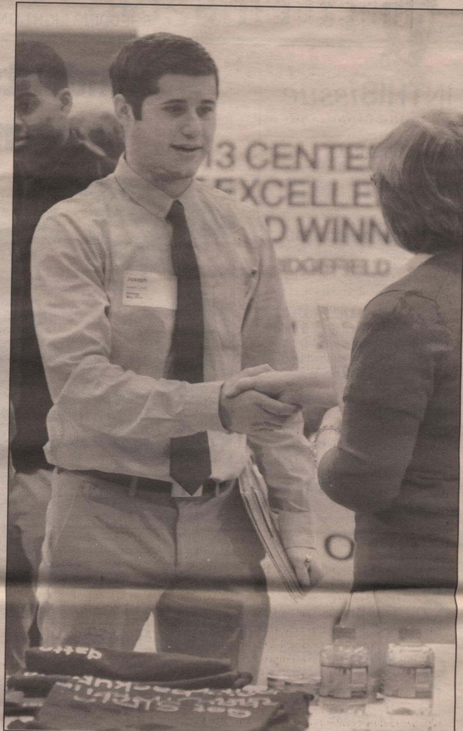
OVER 90 EMPLOYERS WERE PRESENT AT THE CAREER FAIR THIS YEAR.