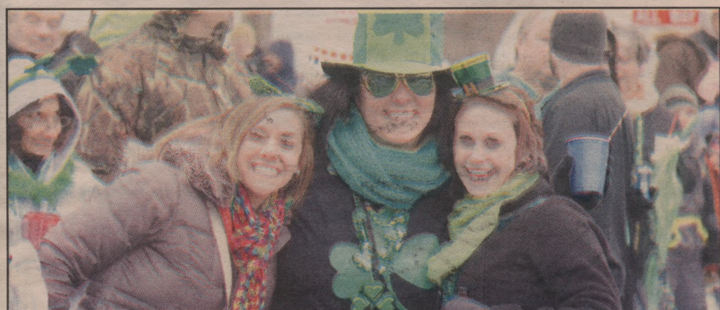
CROWDS ENJOY THE ST. PATRICK'S DAY PARADE ON FRANKLIN STREET IN MICHIGAN CITY, IND.

Since bars around the area know that Sacred Heart is nearby, expect for more information about bar and drinks specials. Stay tuned for the emails and flyers about more information on Red's, and other local happenings about what to do on this holiday.