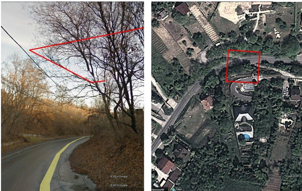
Figure 3. Increment areas in the Google Earth service. The red line is the boundary of polygon from our monitoring system.

The smallest detected increment areas are 3600 m 2 (Fig. 3). Due to the limitation of Landsat images resolution, the mapping output may not be accurate at the desired level, however it is adequate for detection, thus the necessary interventions can be performed. The method application is useful for local and national environmental protection, since it calls attention to the large increment areas, which – literally – are the bad seeds in the landscape.