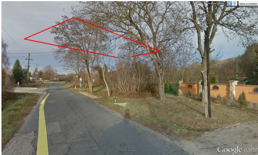
Figure 2. The area is infected by Ailanthus altissima presented in the Google street view service. The red line is the boundary of polygon from our monitoring system

The smallest detected increment areas are 3600 m 2 (Fig. 3). Due to the limitation of Landsat images resolution, the mapping output may not be accurate at the desired level, however it is adequate for detection, thus the necessary interventions can be performed. The method application is useful for local and national environmental protection, since it calls attention to the large increment areas, which – literally – are the bad seeds in the landscape.