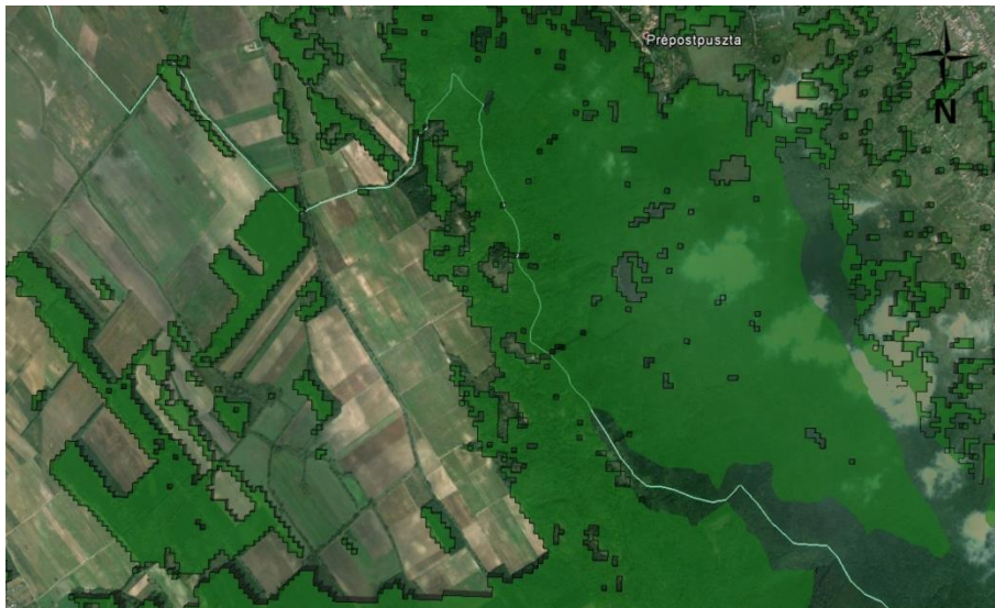
Figure 1b. Woody biomass cover map of the year 2011 controlled with GeoEye space images