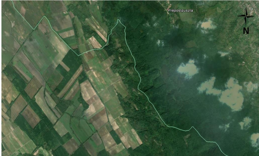
Figure 1a. Test area (illustration background source: Google Earth)