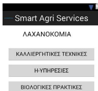
Figure 3. List of options for the horticulture case