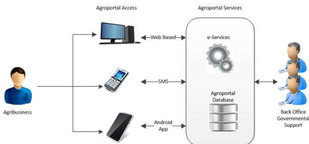
Figure 1. The extended notion of Agroportal system

The extended notion of the Agroportal is presented in the following figure 1. Therefore, the system can be accessed through the Web at the following URL: http://meli.aua.gr/agroportal/ . Also the agribusinesses are able to exchange informative SMS regarding several agricultural issues as described above. The extended version of the system provides availability also on smartphones and tablets.