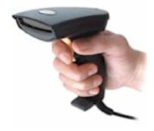
Figure 2. Barcode scanner

The barcode pen-scanner (Fig. 3.) is a simple product that reads, stores, and organizes barcodes (I2). It is excellent for keeping tabs on any barcode-based inventory, books, DVDs, and so on. It comes in a pen-like shape, with small scanner at its point. Once a barcode is scanned, it's kept within the device's 128MB built-in storage, which is apparently small, but actually stores up to a million items. Categories can be assigned for efficient management. It can be used with PC or Mac, where can be stored and synced each barcode to a proper item name and category.