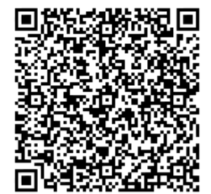
57x57 max. 174 character