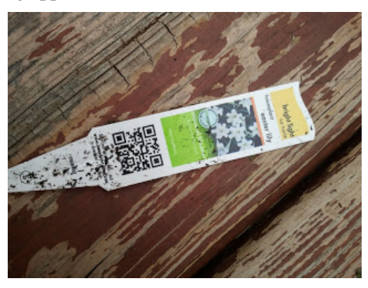
Figure 7. Gardening QR code in gardening

Depending on our objective, QR codes might be placed on brochures and other marketing materials, trucks/trailers, product packaging, or signs. To decide where to place them, we need to understand how our customers behave (Weir, 2010). Place the QR codes where our customers (or potential customers) are. Keep in mind, though, that not all consumers use mobile devices, so QR codes should be used to supplement other promotional tools, not replace them. We may find, though, that some users have a mobile device but simply do not know how to use it to scan QR codes. It's possible that their device came with a scanning application installed.