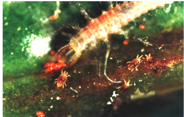
Figure 2 – First instar larva of Chrysoperla externa predating eggs of Brevipalpus phoenicis on foliar discs of 'Catuai' coffee plants (40x).

(SOUZA,1999), may be due to the small mite size, with eggs measuring 0.1 mm and adults 0.3 mm approximately.