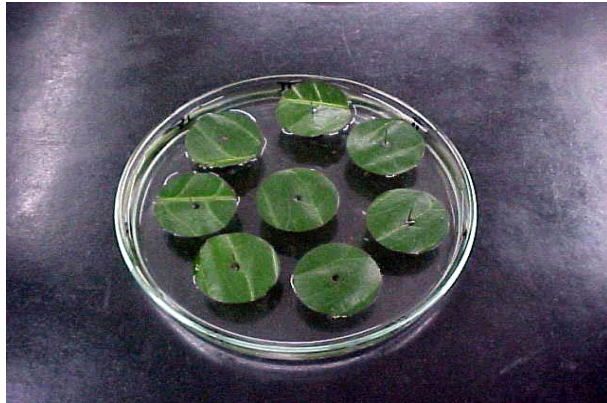
Figure 1 – Arenas used to study predation of Brevipalpus phoenicis formed by 3-cm diameter leaf discs of Catuai' coffee plants, floating on water in Petri dish.

development stage for consumption evaluations for each predator instar .