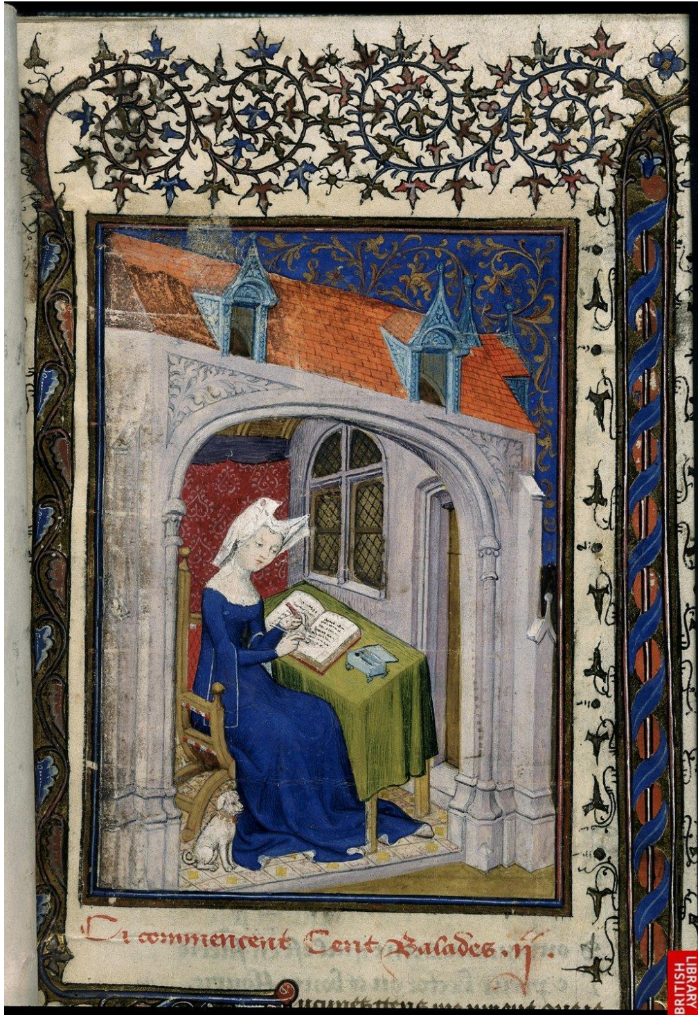
Christine in her study. Collected works British Library Harley MS 4431 f.4r.