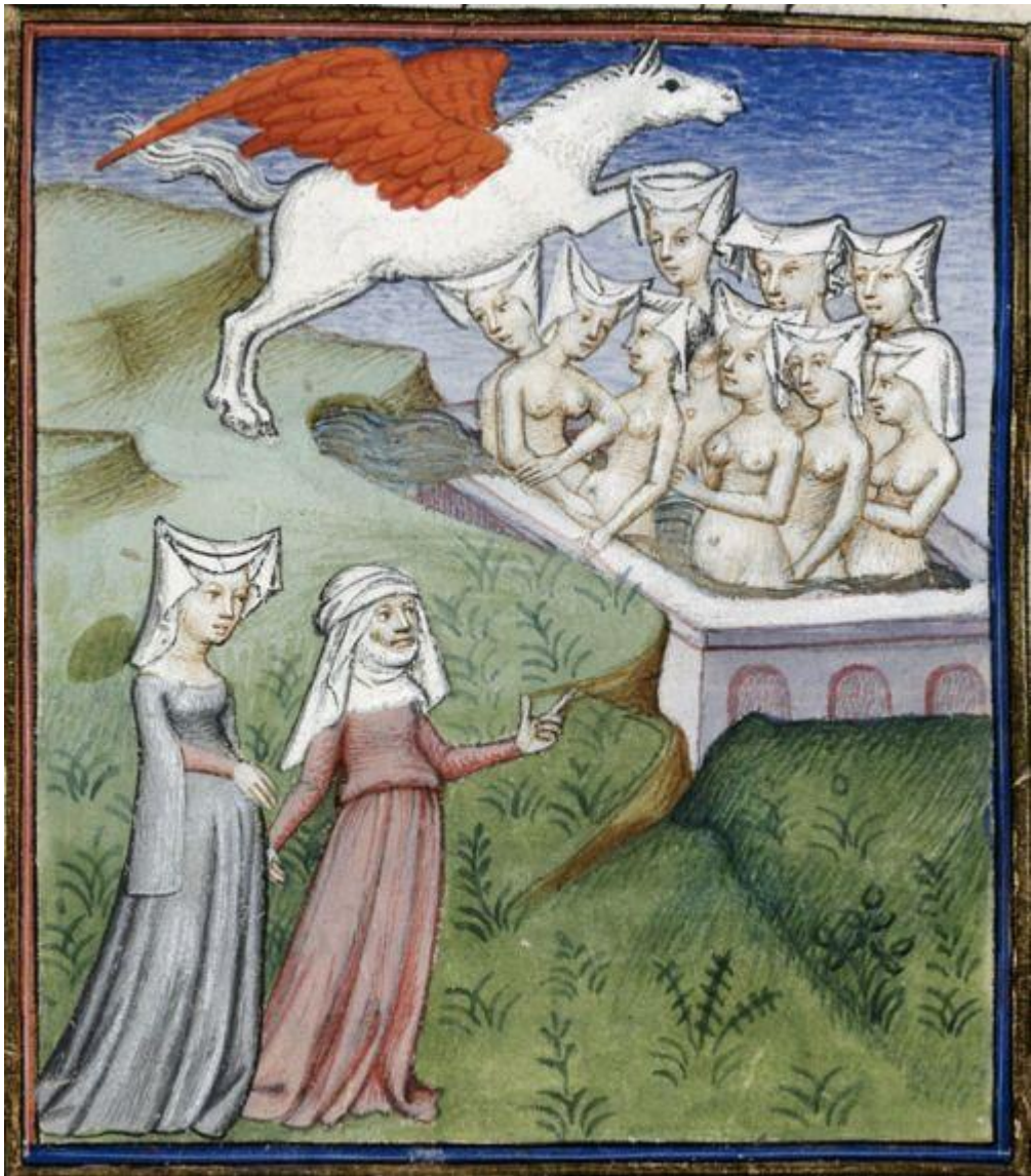
Bath of the Muses Illustration from 'The Path of the Long Study' Christine de Pizan Collected Works, London, British Library, Harley MS 4431. f.183