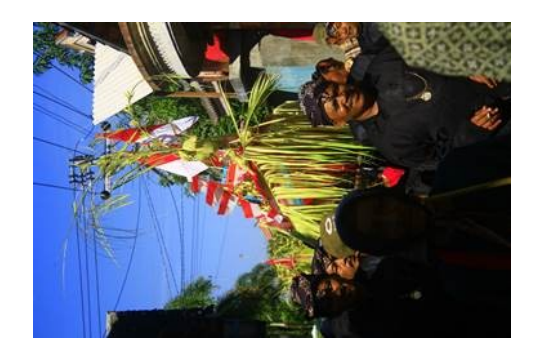
Figure 2. Rituals of Miniature Ship Parade ( Cukrik ) and Larungan Offerings

The process of the Larungan traditional ceremony begins by placing the offerings on a miniature ship, then handing it over to the Village Head, and handing it over to the committee. After that, it is paraded around Bendar Village. The cukrik which has been filled with offerings is then put on the mother ship to be brought out to the sea. When arriving at the sea, joint prayer is carried out and then releases the cukrik and offerings into the sea.