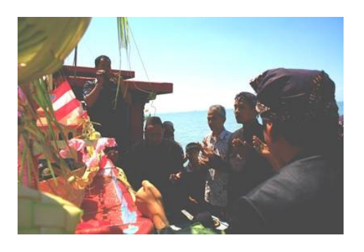
Figure 4. Prayers Together Before the Miniature Ships and Offerings are Released into the Sea

Figure 4 shows the fishing community gathered around the ships and offerings to pray together (in Javanese) before being released into the sea. The essence of the prayer is "mugo-mugo dianakno upacara iki, hasil laut nelayan iso nambah, berkah, lan ora ono alangan opo-opo saben neng laut, mulih selamet gowo hasil akih", which means that hopefully with the implementation of this Larungan ceremony, the fish catches by fishermen are increasing, blessed, and there are no obstacles in carrying out activities at sea and returning home with lots of fish.