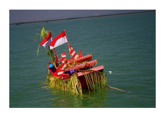
Figure 5. Miniature Ships ( Cukrik ) and Offerings are Released into the Sea

Figure 5 shows the ships and the offerings that have been released into the sea. The release was carried out after the prayer was held together. These cukrik and offerings are presented by the people of Bendar Village as gratitude so that they can get abundant fish and given protection and safety. When the mother ship (which was carrying cukrik and offerings) arrived in Bendar Village, some people deliberately took the offerings and the