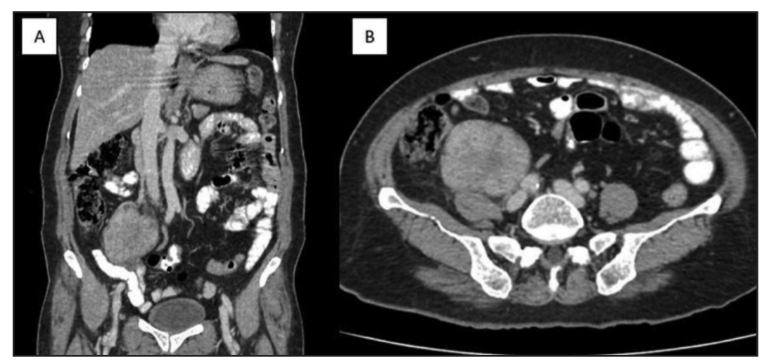
Fig. 1: CT scan of abdomen and pelvis. Coronal section (A) and transverse section(B) showed heterogeneous right iliac fossa mass with loss of clear fat plane with right psoas muscle but preserved fat plane with iliac vessels and overlying bowel loops. Mass compressing the right ureter causing mild hydroureter and hydronephrosis.

The appendix is a tubular structure consisting of all layers of bowel with irregular lumen. The mucosa is thrown into multiple longitudinal folds and is lined by simple columnar epithelium of colonic type. Its length varies between 7.5 and 10cm. Appendix is supplied by appendicular artery, a branch of ileocolic artery which runs in the free edge of mesoappendix. Appendix can be easily mobilized with its intact blood supply and retroperitonialised to repair the right ureteric defect. Appendix is the ideal structure for reconstruction of right ureter because of its ideal location and