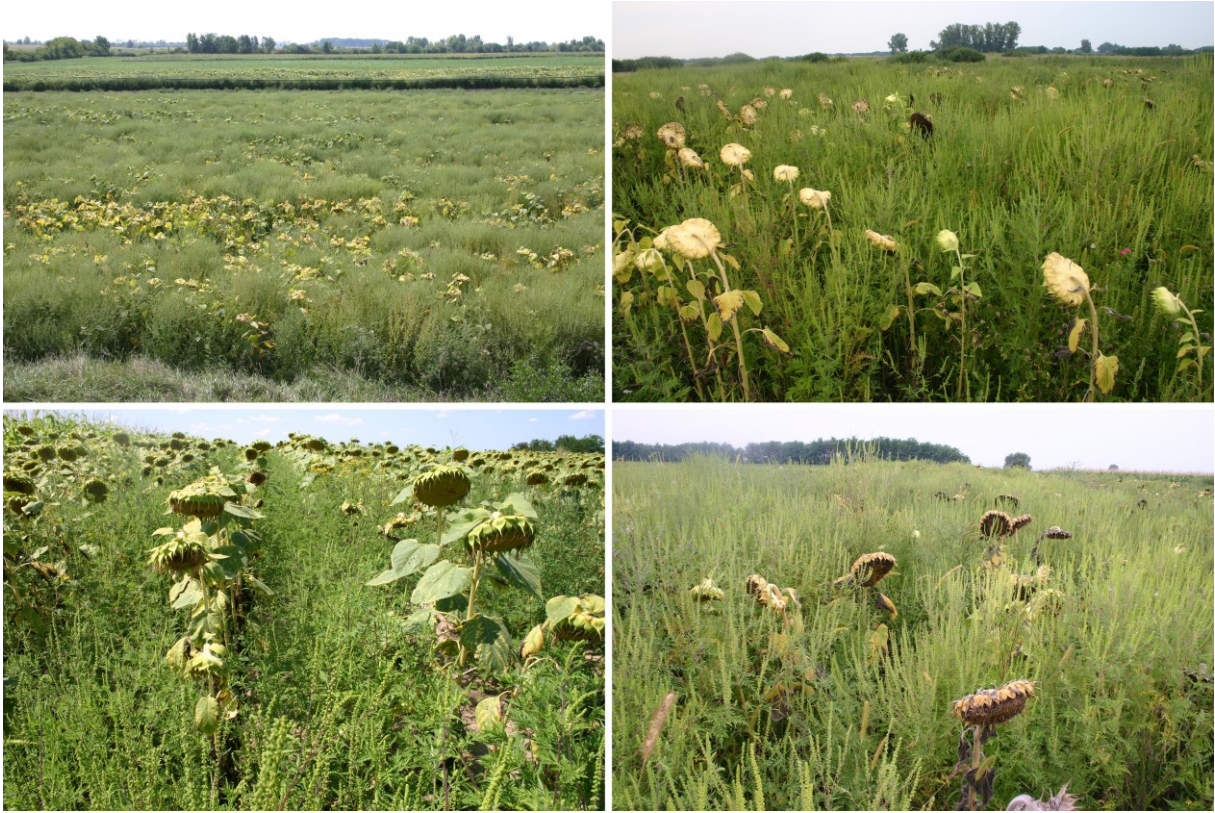
Fig. 1 Sunflower fields, heavily infested with Ambrosia artemisiifolia