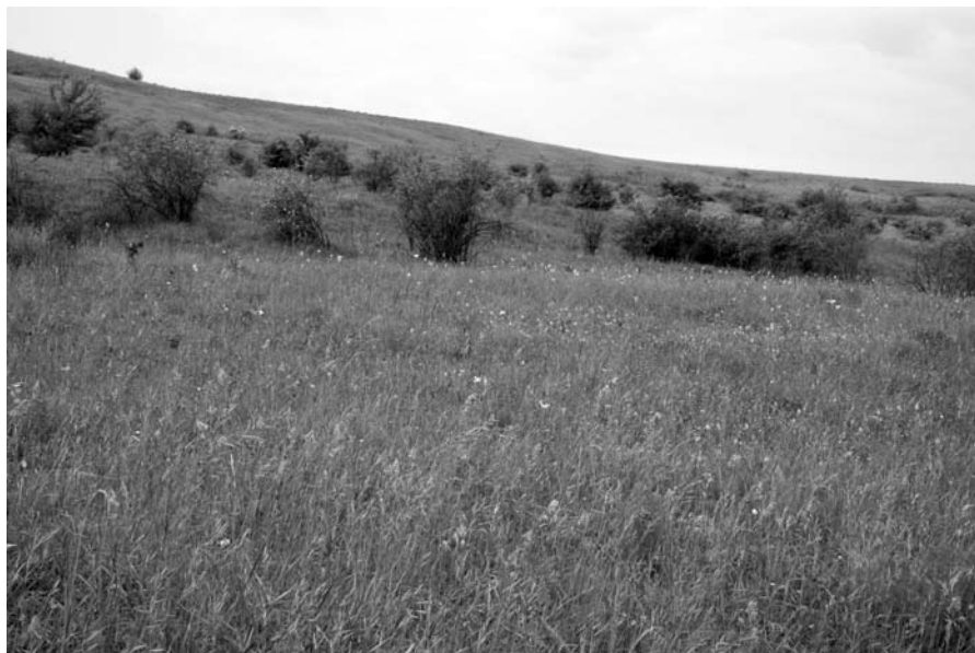
Fig. 2: The site at Răscruci where Maculinea nausithous larvae were found in Myrmica scabrinodis nests (compare with Tartally & Varga 2005: Fig. 2, where M. nausithous was found with Myrmica rubra ).

To obtain data on host specificity, Myrmica nests within 2 m of S. officinalis host plants were carefully opened (usually without full excavation, to minimize disturbance) on both sites, and the presence or absence of M. nausithous larvae was recorded. Nests within 2m of host plants were chosen as this is the approximate foraging zone of Myrmica workers, and nests further from the host plants are unlikely to adopt Maculinea larvae (Elmes et al. 1998). The investigations were from late May to early July 2002 and 2007, so that all the recorded larvae had spent the winter in their host nests, surviving one of the most critical periods for the butterfly (Elmes et al. 2004). Investigations were