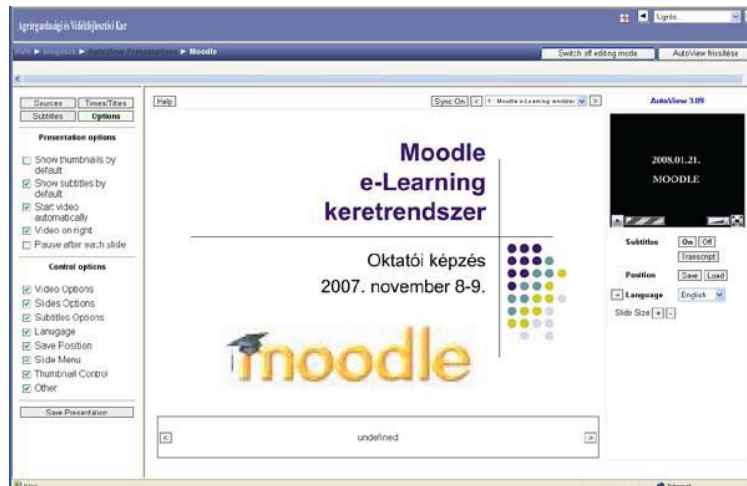
Figure 3. Using AutoView module in Moodle

Slides can be prepared in Powerpoint (or similar formats), but you will need to import your slides into Open Office to create the final Flash movie. Once you have your slides in OpenOffice, use the File/Export menu option. Select Macromedia Flash (SWF) (.swf) from the file format drop down, choose a file name and save the slides. You might be able to use Flash files created by other PPT-SWF conversion software. Alternatively, if you can't access OpenOffice to create the flash movie, you can use a set of image files. Manual creation of these files could be quite laborious; you will need to export your presentation as JPEG images