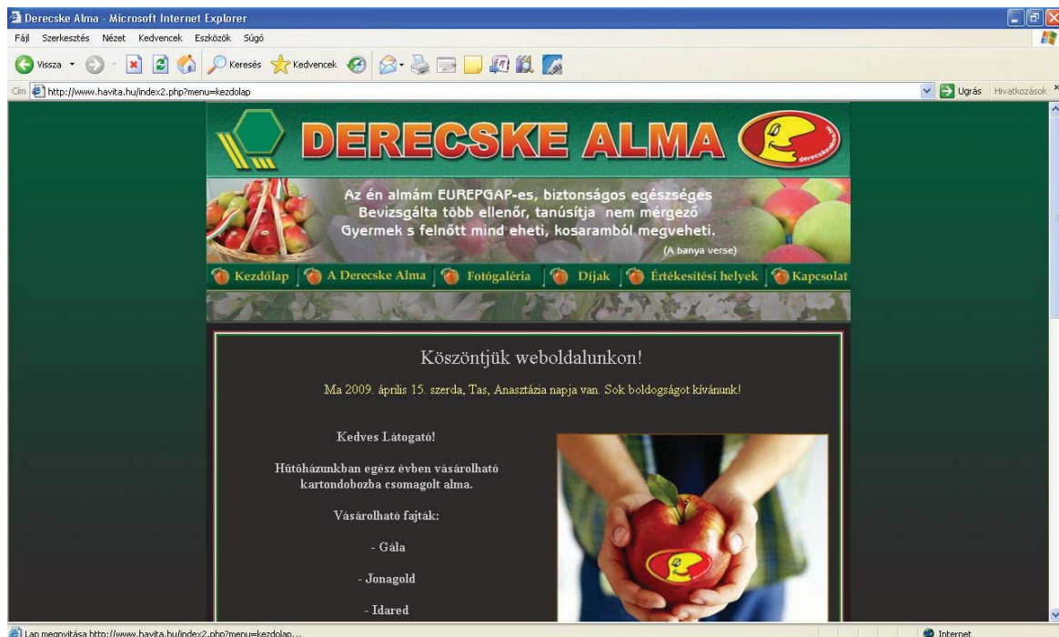
Figure 2: Homepage of Havita PO

Online marketing is a very positive point of view that the "apple sale" in the title in the search engines displays the first page. Google show these words in 7. position. But you could also improve body "TÉSZ" (PO) of a title, since it is only the third site to be found, and a number preceded by PO. Other companies linked to the title page of the search engines are the first 5 cannot be found. Perhaps it would be worthwhile to extend the online marketing in that direction.