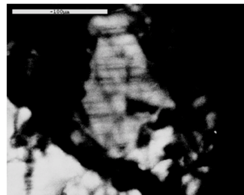
Fig. 2 CL image of alkali feldspar in suevite from Ries Crater, Germany