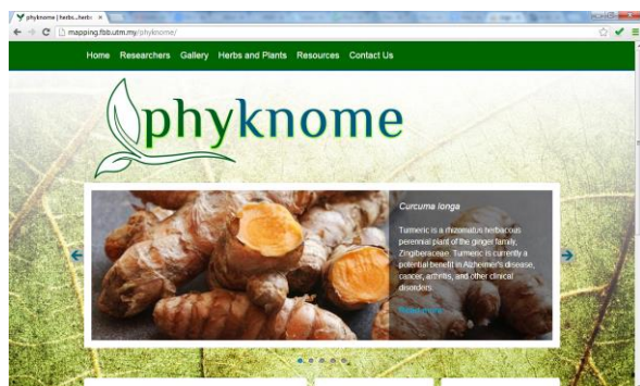
Figure 2 Screenshot of Phyknome ( http://mapping.fbb.utm.my/phyknome/ )

The construction of Phyknome which specializes on ethnobotanical information offers comprehensive database with more than 22,000 species of plants with nutritional value based on ethnobotanical data primarily from local culture. The content contains taxonomy classification of the specific plants, medicinal usage and active compound that is readily accessible