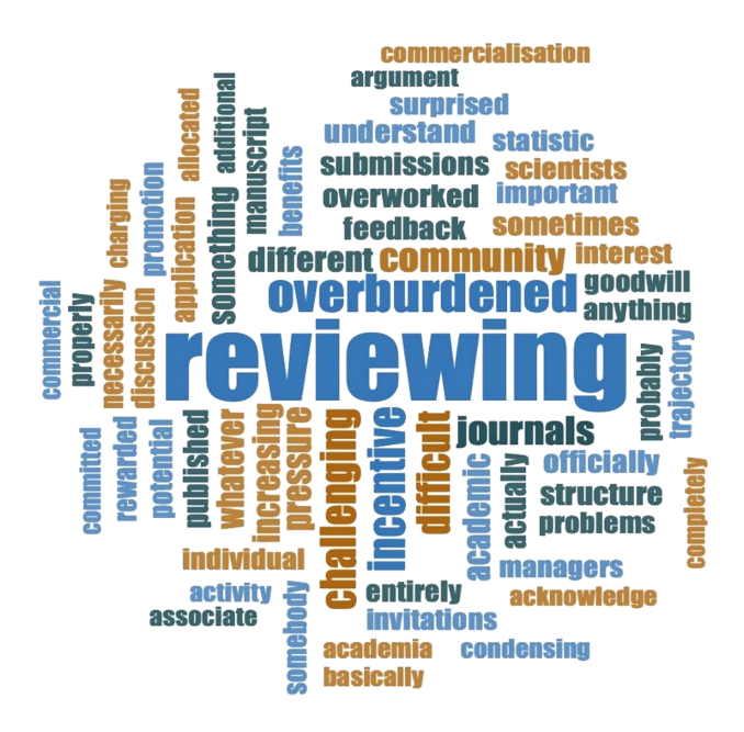
FIGURE 1 Word cloud of keywords. Keywords discussed in relation to overburdening of reviewers, represented by frequency (larger text indicates greater frequency) using NVivo 12.

Reviewers do not have an awful lot of time [...] and it's always getting more and more difficult to find good