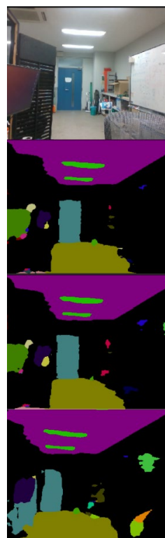
Figure. 1 Comparison between different models

to bottom, the original RGB image, PSPnet_50, PSPnet_50 with Bayesian filter on, and the unmodified ResNet_50 image. From the comparison graphs, it can be seen that Bayesian filter does not contribute much to the semantic segmentation accuracy of indoor scenes, while PSPnet, as an improved network based on ResNet, reflects better results on ade20k dataset. It can be seen from the figure that PSPnet accurately identifies the screen that appear only partially in the scene (green part), while the original ResNet is more ambiguous.