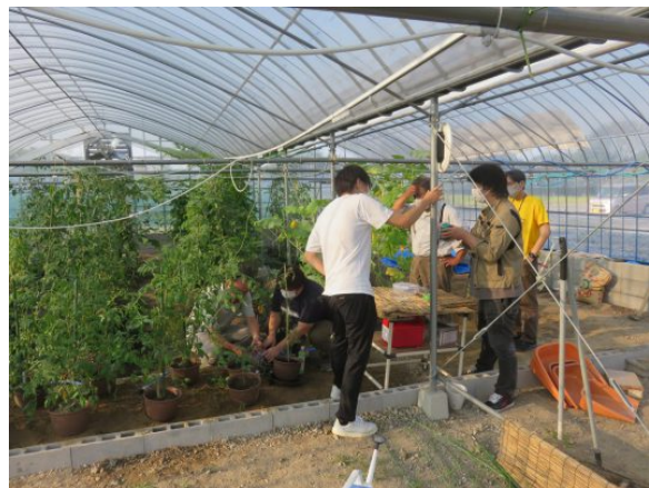
Fig.2 Scene of Experiment (Installation of IoT devices)

Fig.3 Temperature data acquired by IoT devices CNN (Convolutional Neural Network) as a method of application in a farm. CNN is capable of recognizing objects in images. Therefore, in this exercise, we created an artificial intelligence architecture to recognize caterpillars in a farm. In this exercise, we used google collaboratory.