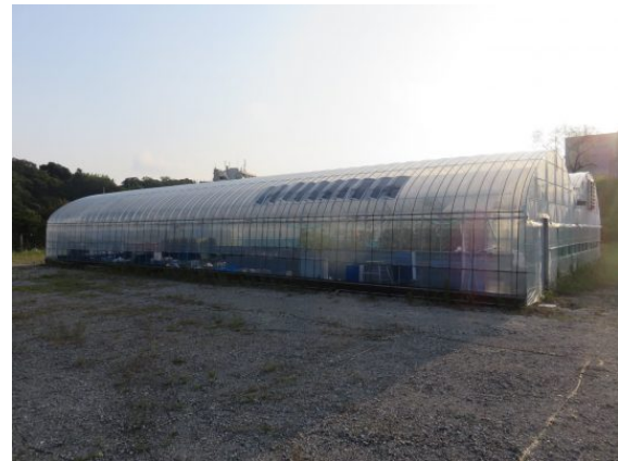
Fig.1 Experiment green house field

The students have already learned the outline of programming techniques and artificial intelligence in the common courses. Therefore, in this exercise, we used