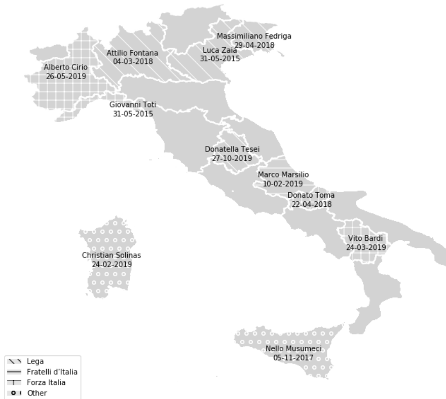
FIGURE 1 Regions governed by the centre right