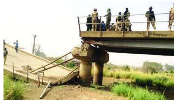
Fig. 3. Katarko bridge