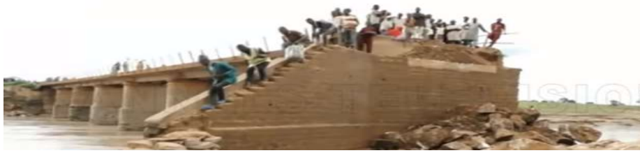
Fig. 1 Gulbim Boka Bridge