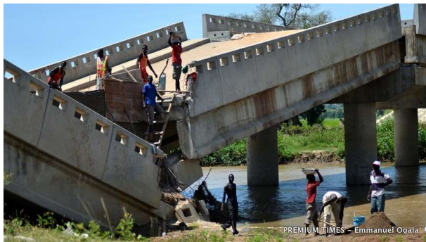
Fig. 2. Kudzum bridge