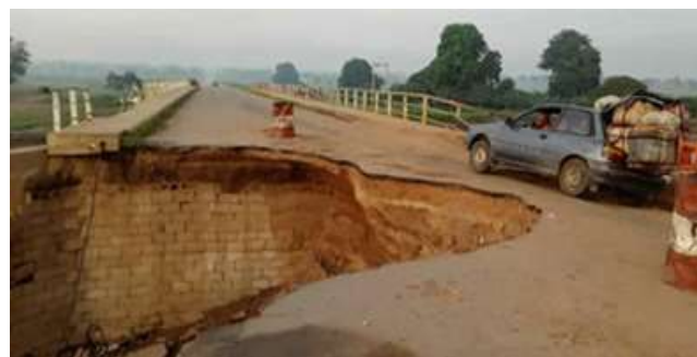
Fig. 5 Bridge along Wukari-Jalingo road after 2 months

Significant portions of the earth filling behind the abutment was washed away by floods and no significant remedial work was done by the road maintenance agencies. The bridge deteriorated further as the back fill was exposed to the flow of the river. Fig. 4 Bridge along Wukari-Jalingo road Fig. 5 Bridge along Wukari-Jalingo road after 2 months