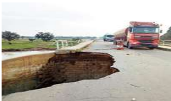
Fig. 4 Bridge along Wukari-Jalingo road

There is a need for developing countries to provide adequate infrastructure to accommodate their rapid growing population in their urban areas but financing, implementing and maintaining the needed infrastructure is a major challenge facing many developing countries today [61]. Available funds cater for the immediate needs of the population such as portable water, electricity, roads, sanitation, and education and not much focus is placed on maintenance of the infrastructure that is already in place [62]. Roads and bridges are constructed and adequate funds are not provided to maintain them [63]. With an increase in the rate of urbanization in the country, the focus has gradually shifted to urban centers over the years. Even though the problem of maintenance exists both in rural and urban communities, rural communities face more neglect as existing infrastructure in rural areas are left to decay by the government but in some cases are salvaged by members of the community. Bridges in Nigeria especially in the rural parts of the country have been left to decay and this has led to the partial and complete collapse of many bridges. Fig. 4 showed one of the bridges along Wukari-Jalingo road in Taraba state as at September 2018.