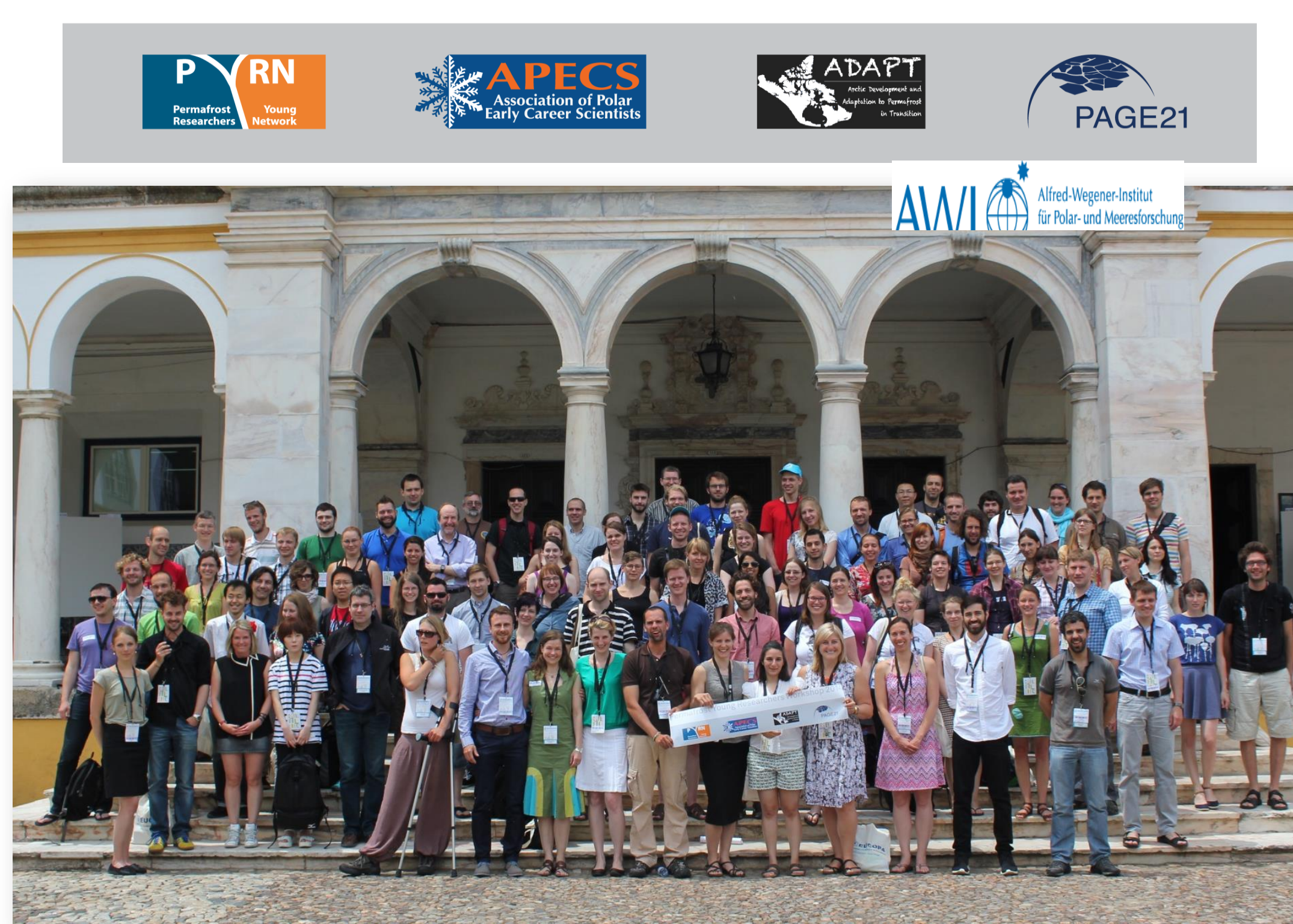
Participants of the Young Researcher Workshop at EUCOP4, Summer 2014