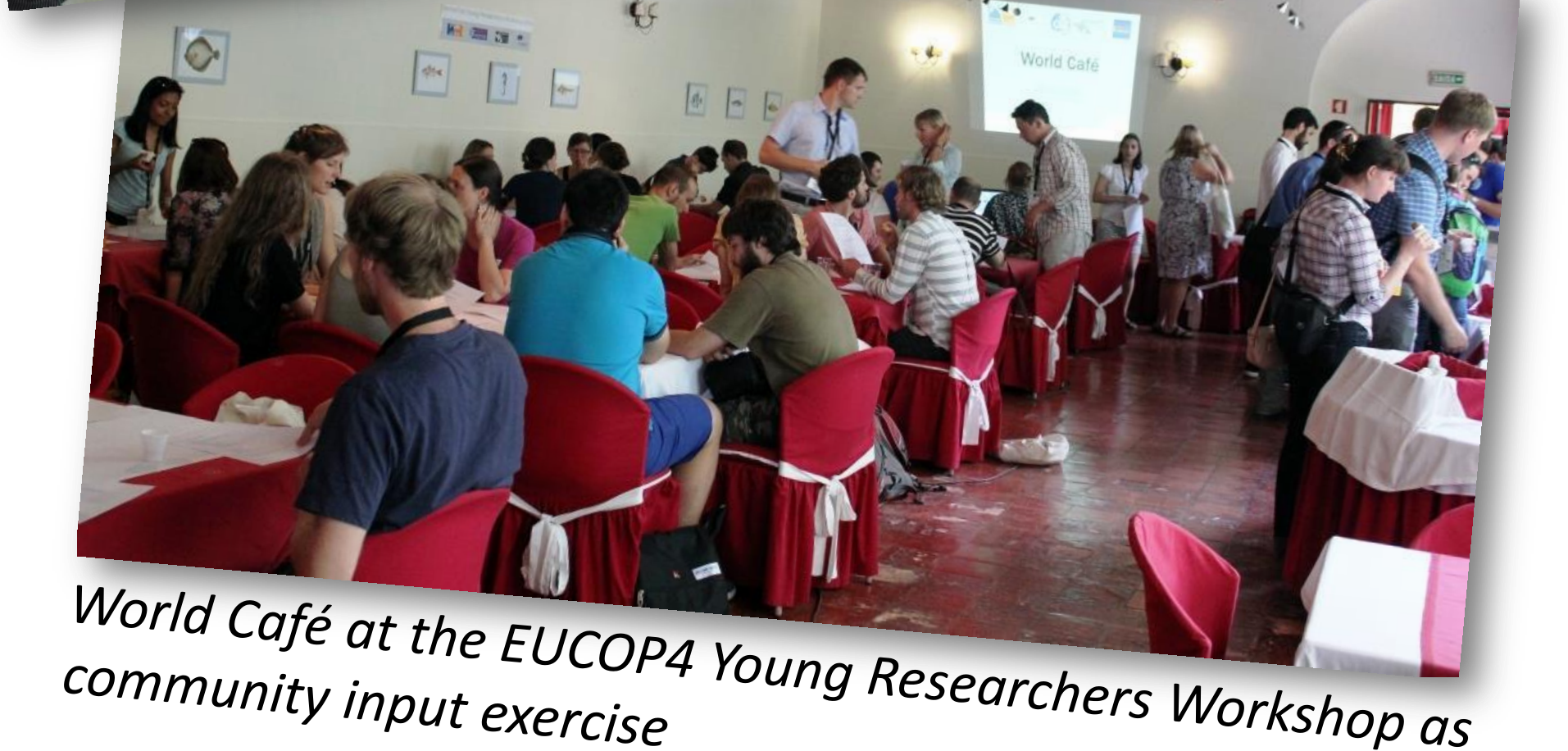
World Café at the EUCOP4 Young Researchers Workshop as community input exercise