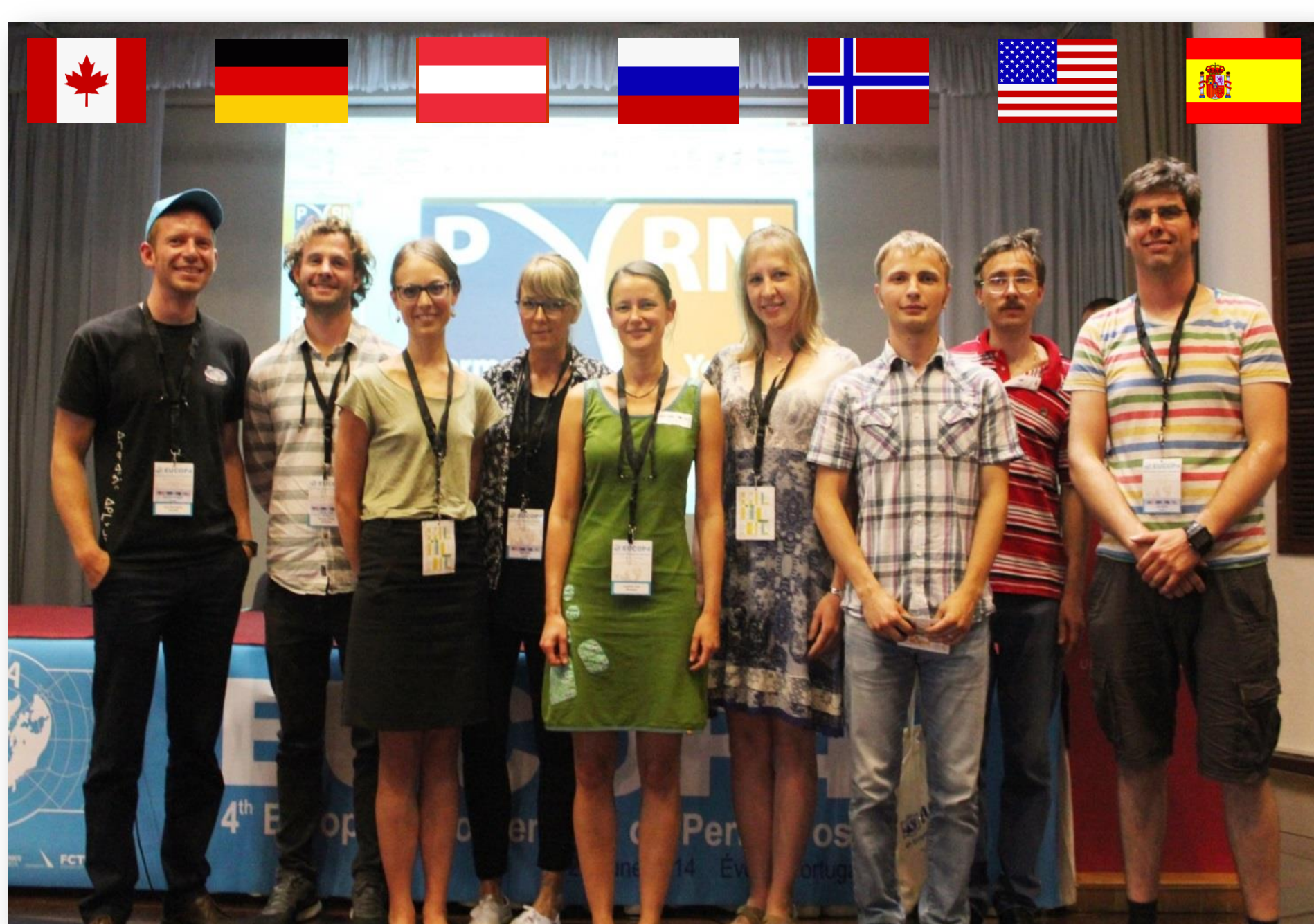
PYRN Executive Committee 2014 to 2016