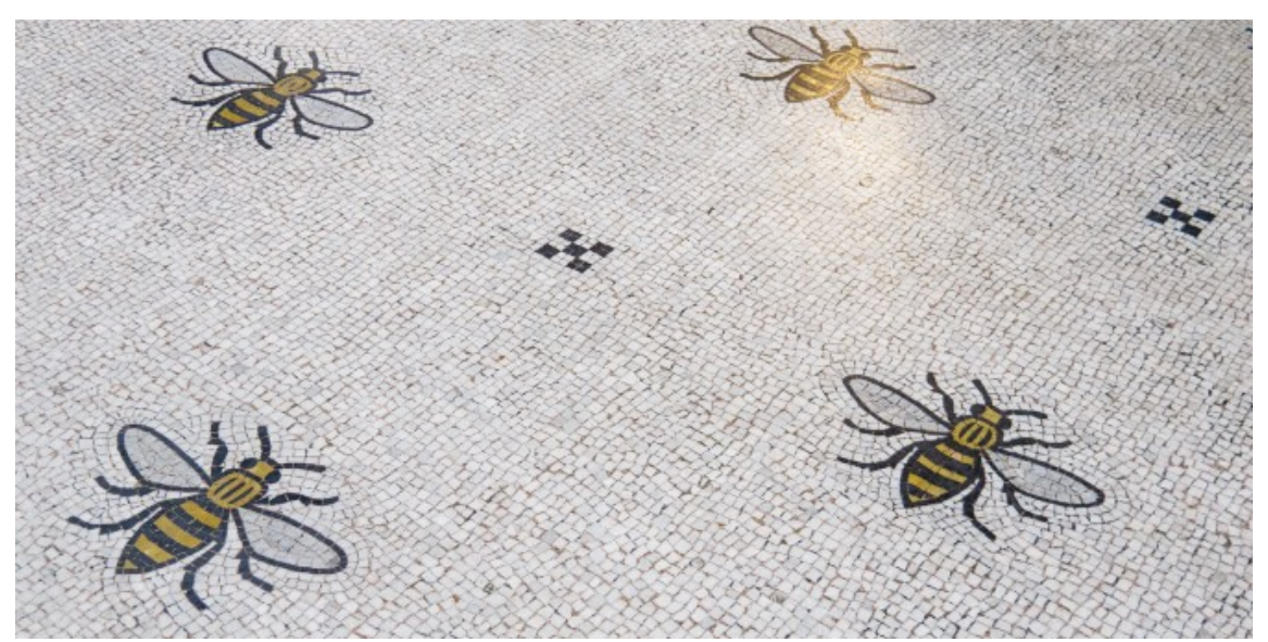
Bees at Manchester Town Hall.

There was no repeat of the initial trust dividend seen in the first period of lockdown once infection rates began to rise again with the onset of a second wave and as restrictions started to be reintroduced. Levels of distrust remained consistently high through to October 2020, with levels of general political distrust rising from 57% to 61% through December 2020, straddling the imposition of Tier 4 restrictions on London and the South East of England.