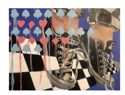
Tip-Toe , 2020